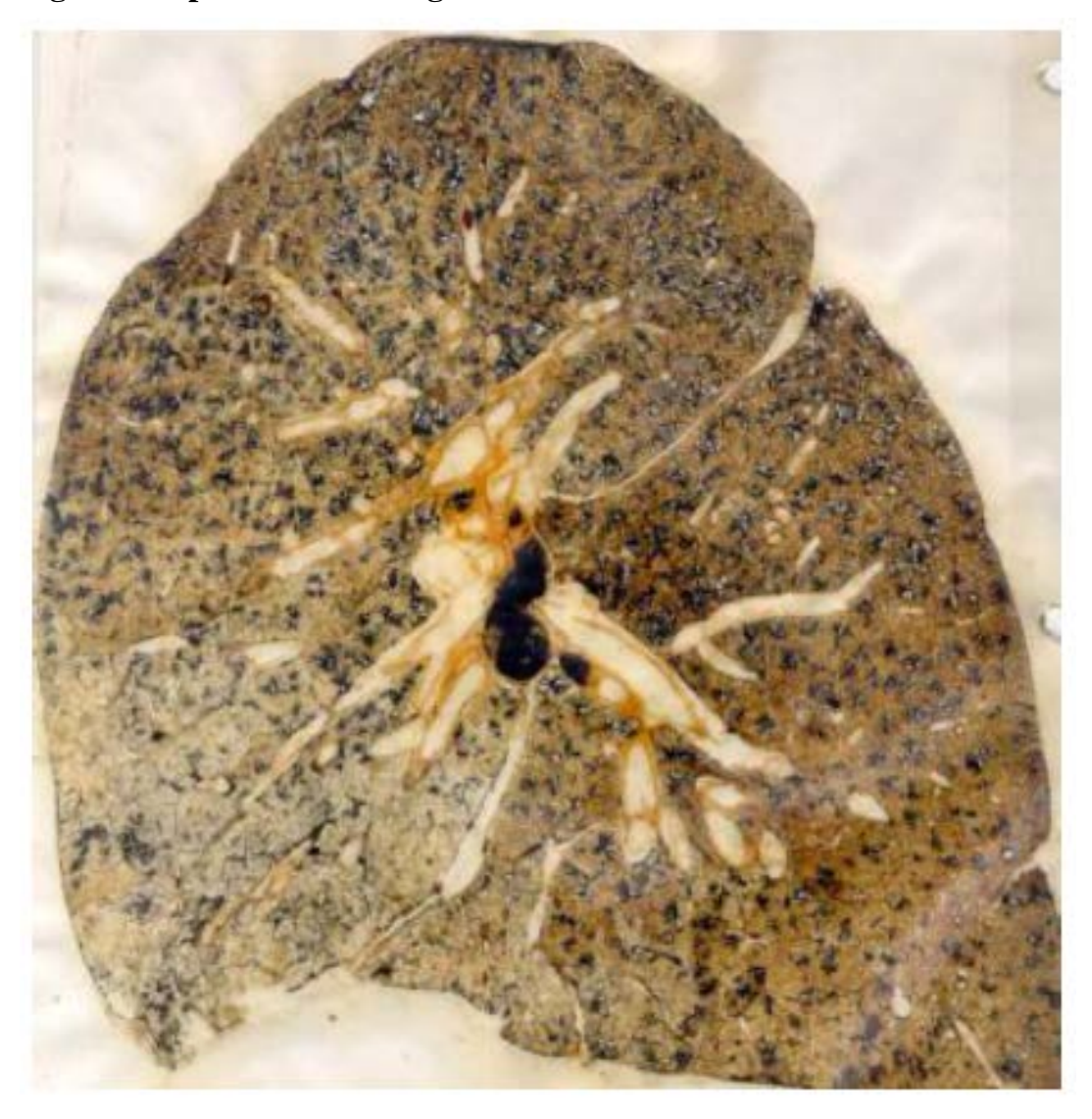
Figure 1—specimen of a lung with CWP nodules<sup>6</sup>