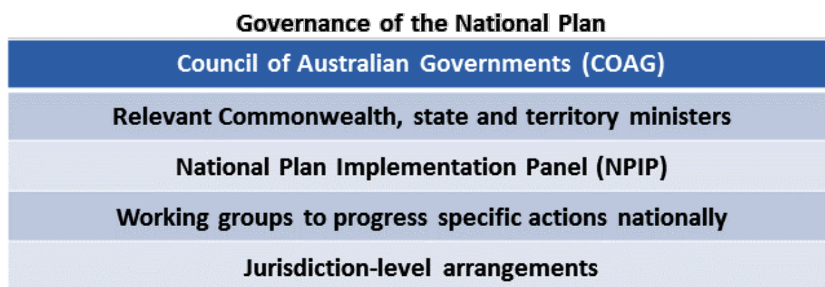
Figure 3: Governance Structure of the National Plan

3.25 The National Plan Implementation Panel (NPIP) was intended to report to ministers on emerging issues to inform the evaluation of Action Plans and the development of future subsequent Action Plans.