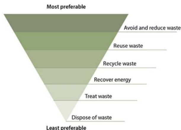
Figure 2.1—Waste hierarchy