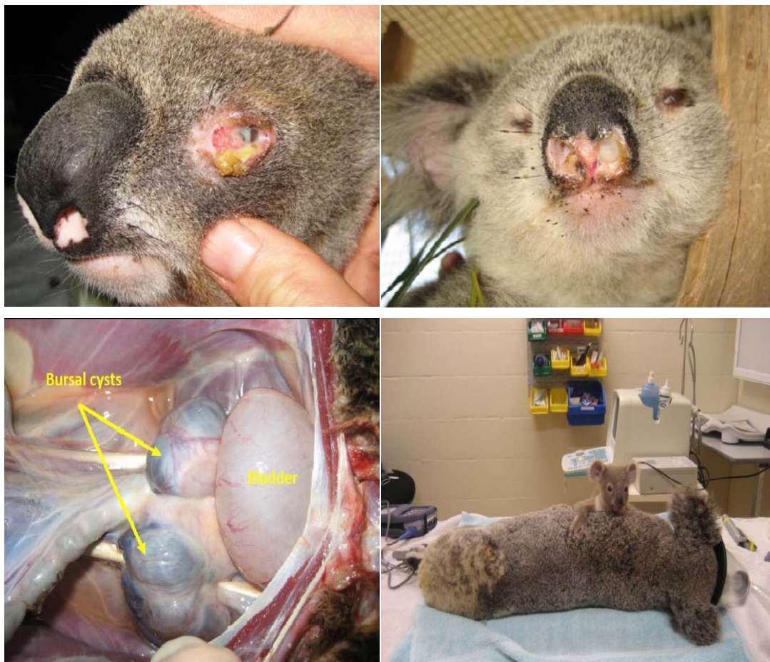
Picture 4.1—Diseased koalas (clockwise from top left: Anatomical Chlamydia Disease Score (Eyes) Chronic kerato-conjunctivitis with active inflammation and muco-purulent discharge; Chlamydial rhinitis characterised by nasal discharge; Veterinary health examination of a female koala (with a joey) under general anaesthesia; and Anatomical Chlamydia Disease Score (Urogenital tract) Cystic ovarian bursitis - overall this koala was in good health and body condition)