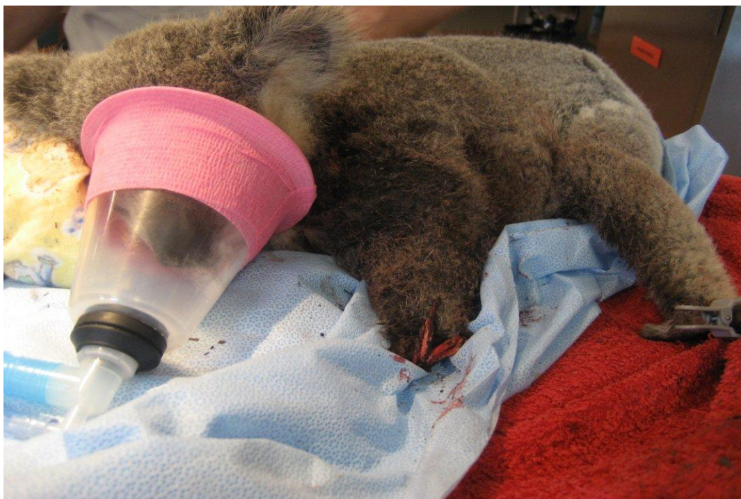
Picture 4.2—Koala with left forepaw injury as a result of a domestic dog attack