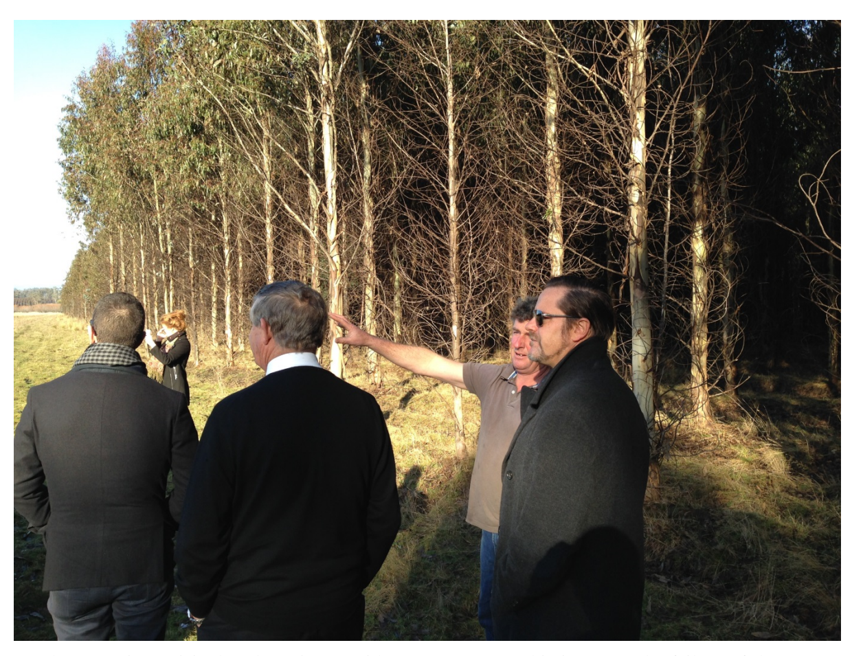
The committee visited a plantation outside Launceston. In this instance, the failure of the FMIS led to the foreclosure and sale of the property. The visit also provided an example of where tree growth rates did not meet the expectations outlined in the prospectus.