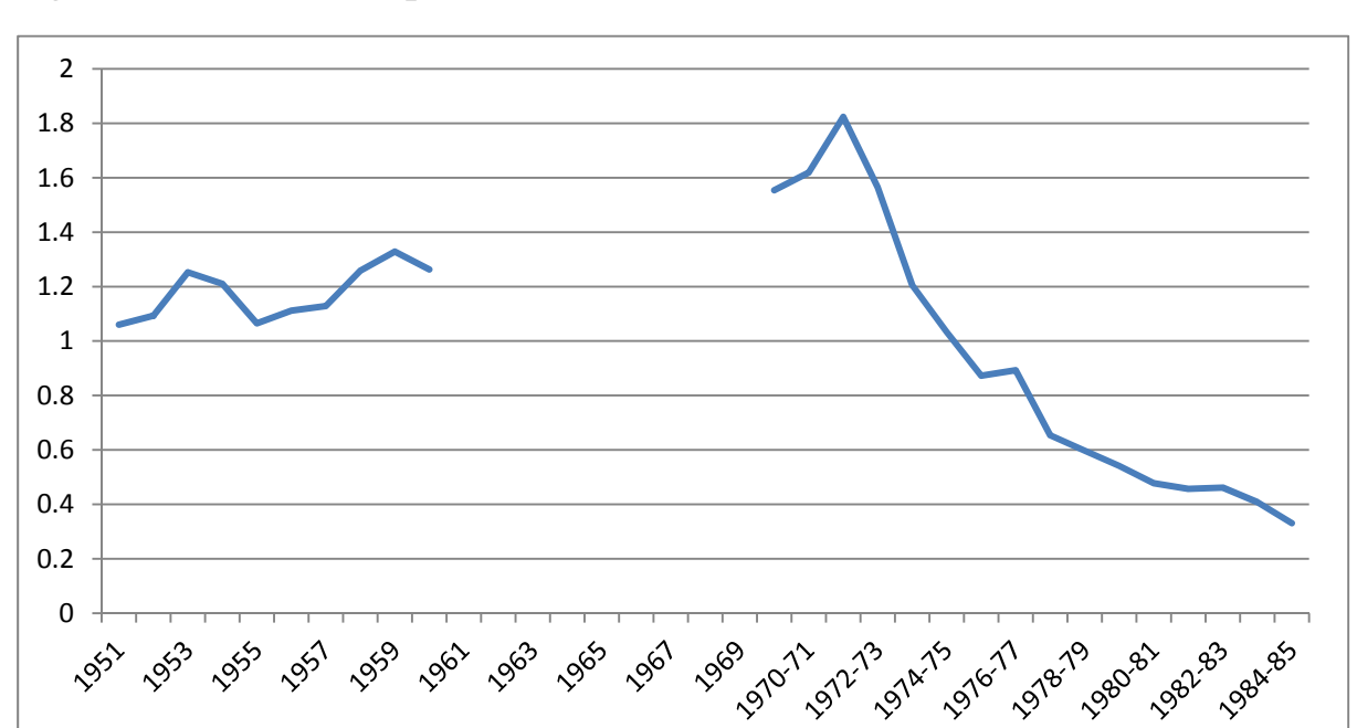
Figure 1.2—Rate of adoptions in Australia 1951–1985

1.37 The rapid decline in adoption after 1971–72 was very closely correlated with a rapid decline in births amongst women generally, and amongst teenage women in particular. This decline, which began in 1970, is shown in Figure 1.3 below, which compares rates of adoption with rates of births to teenage women. While there is a