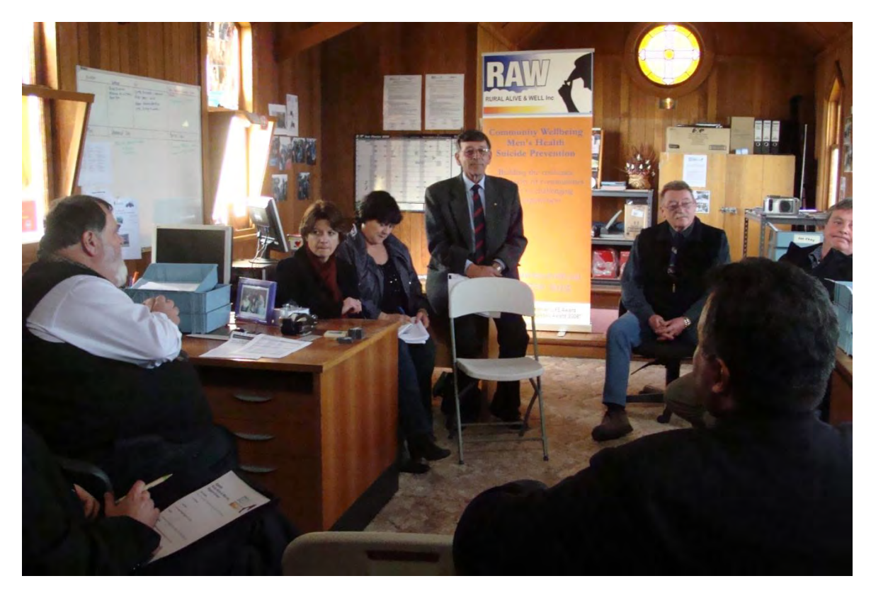
Committee members meeting with representatives of Rural Alive and Well, Melton Mowbray, Tasmania

That is where I think the peer-to-peer stuff is really important, because of the similar experiences going on. Helping each other with how you manage through it has been really important. There have been some fantastic examples of getting farmers together just to talk about what is going on and how they are managing through it and, if they are not managing through it, then actually getting in there and intervening. Peers are often a stronger help because of the social way that farmers are, more so than perhaps a rural counselling service.<sup>11</sup>