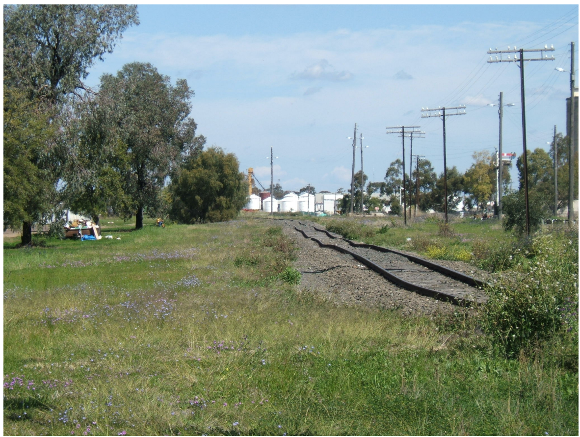
Challenges faced on flat, black soil, hot western environments.

In recent years, roads in the Moree area have received significant funds to repair flood damage affects, and to a much greater scale than has been required on the higher New England country.