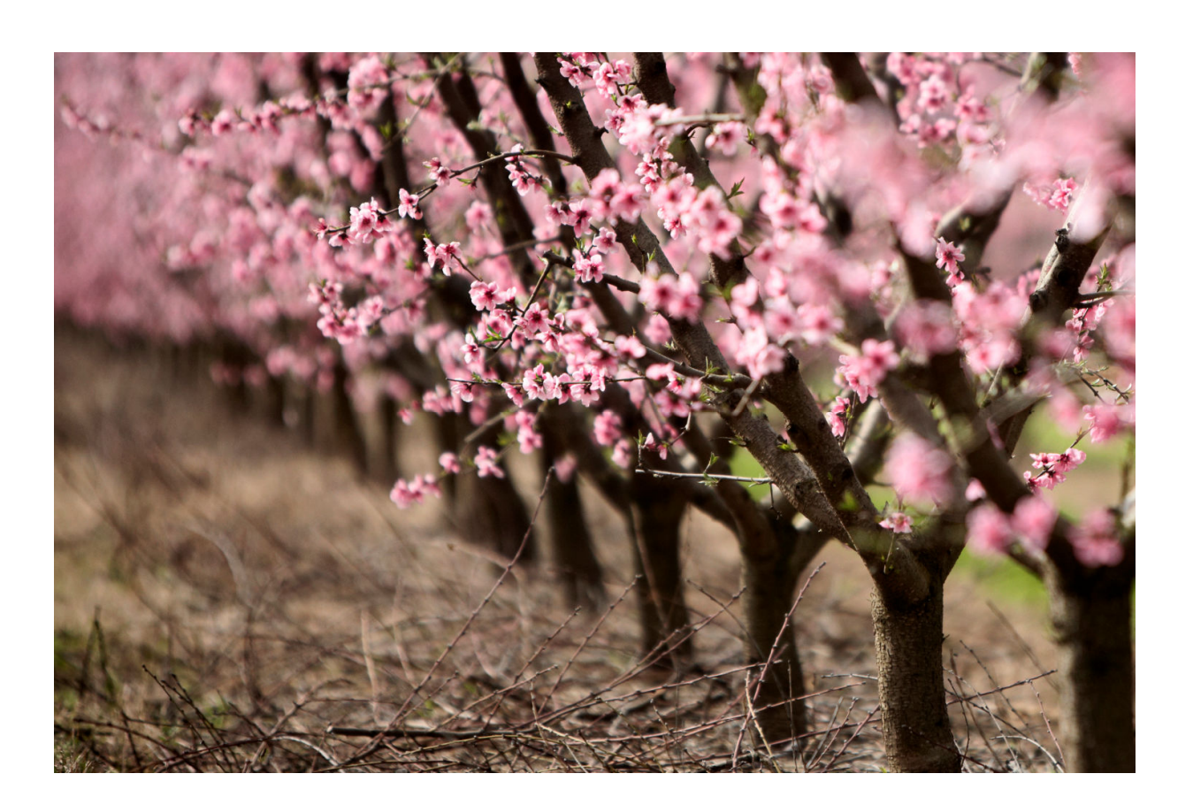
Orchard at Shepparton East