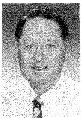
P.O. Box 226 Aitkenvale Q 4814

Telephone: (07) 4725 2066 Facsimile: (07) 4725 2088