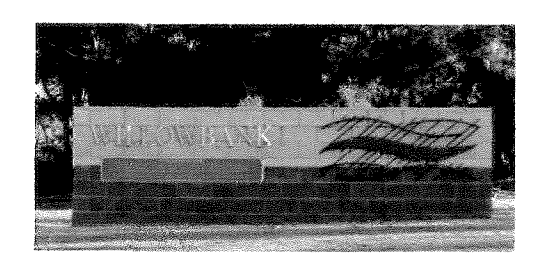
O'Neil's Road - WILLOWBANK