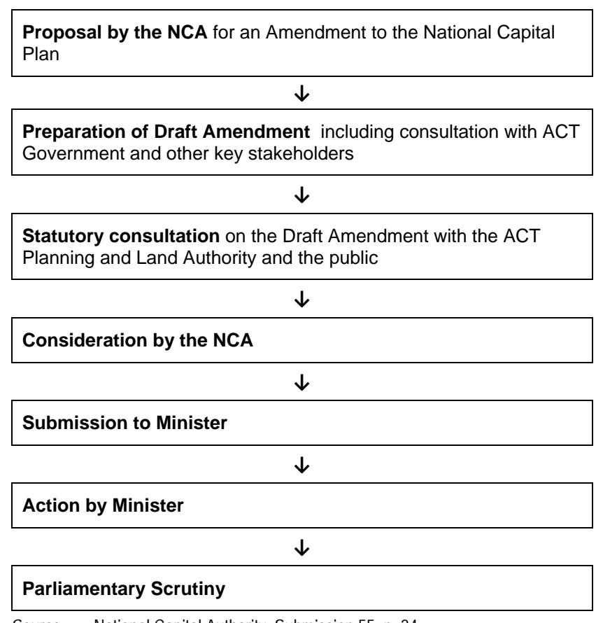
Table 3.2 Amendments to the National Capital Plan: Process Flow Chart