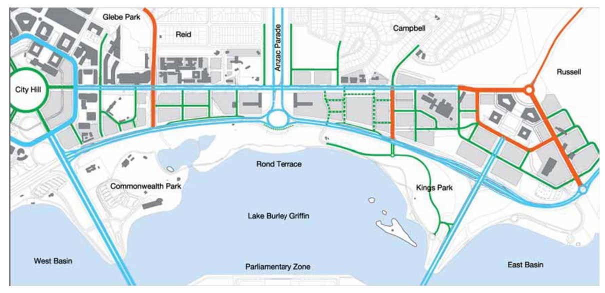
Figure 4.1 Amendment 60: Indicative Road Structure