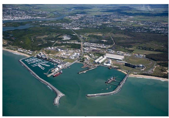
Port of Mackay