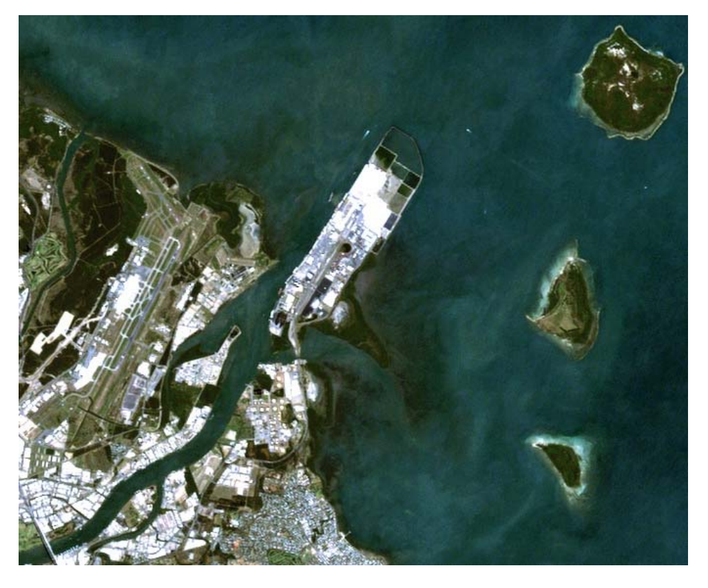
Figure 2: Satellite map of the Port of Brisbane showing the Fisherman Islands wharf facilities in the centre. A supplementary fleet base could be developed at a new reclaimed land site extending further into Moreton Bay from the current facilities and linked to the Port of Brisbane by a causeway.