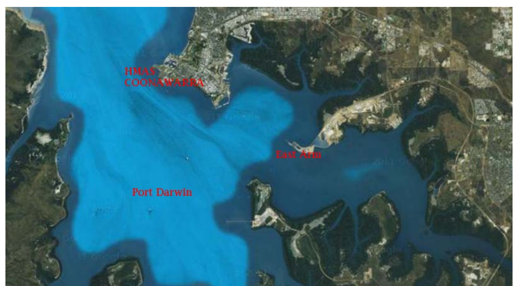
Figure 3: Darwin harbour, showing HMAS Coonawarra and East Arm wharf.