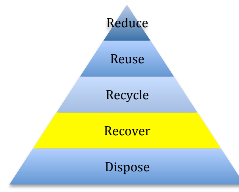
Figure 1: The Waste Management Hierarchy

WtE sits in the waste management hierarchy just after recycling and as such both processes are often done in conjunction at most WTE plants around the world.