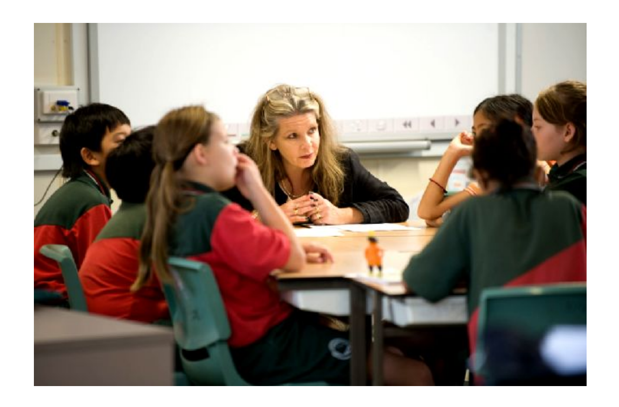
Figure 1.3 The Committee during discussions with students and teachers at McGregor State School.