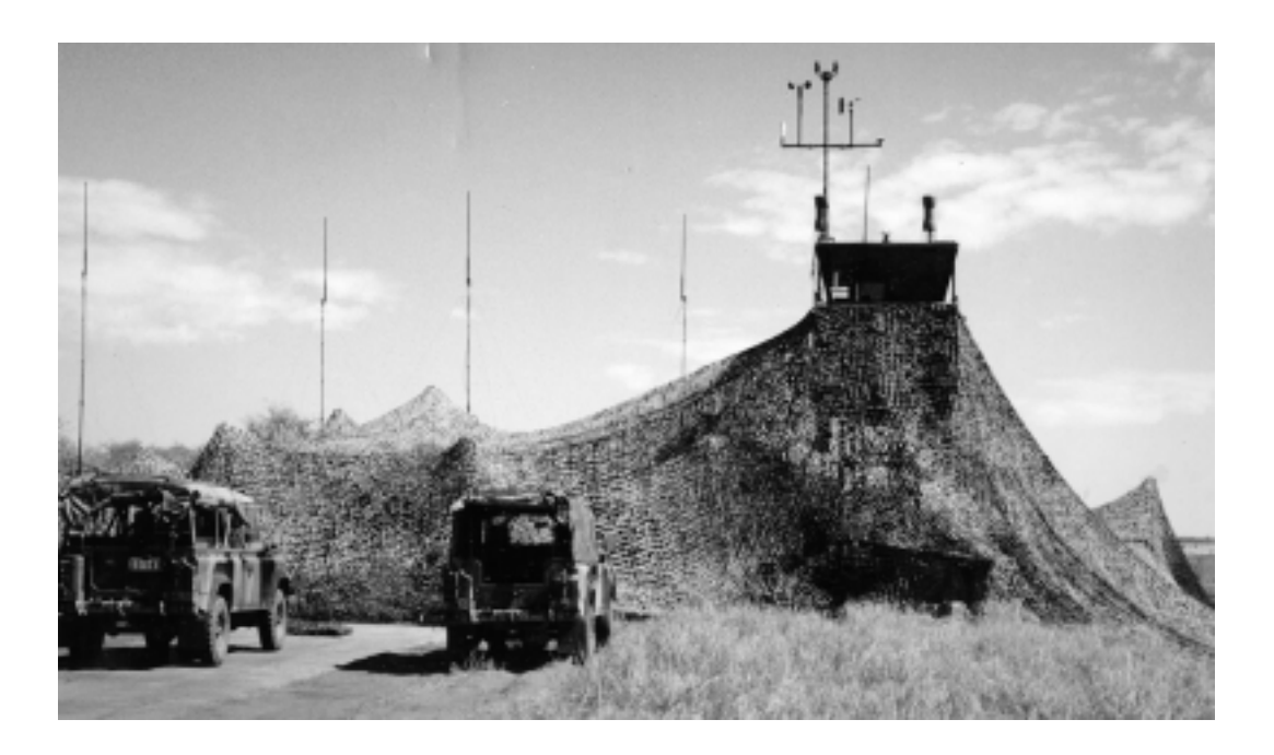
Figure 1.4 Tactical air traffic control facilities

1.18 RAAF Air Traffic Control detachments provide aerospace management of tactical and non-tactical airspace for safety and efficiency reasons. RAAF Air Traffic Control works closely with civil Air Traffic Control and other Aerospace Battlespace Management agencies to deconflict airspace users. RAAF Air Traffic Controllers provide air traffic services for all ADF military and joint user aerodromes.