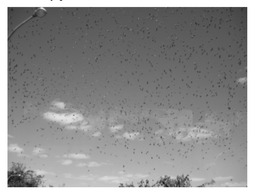
Figure 4.2 RAAF Tindal flying fox infestation