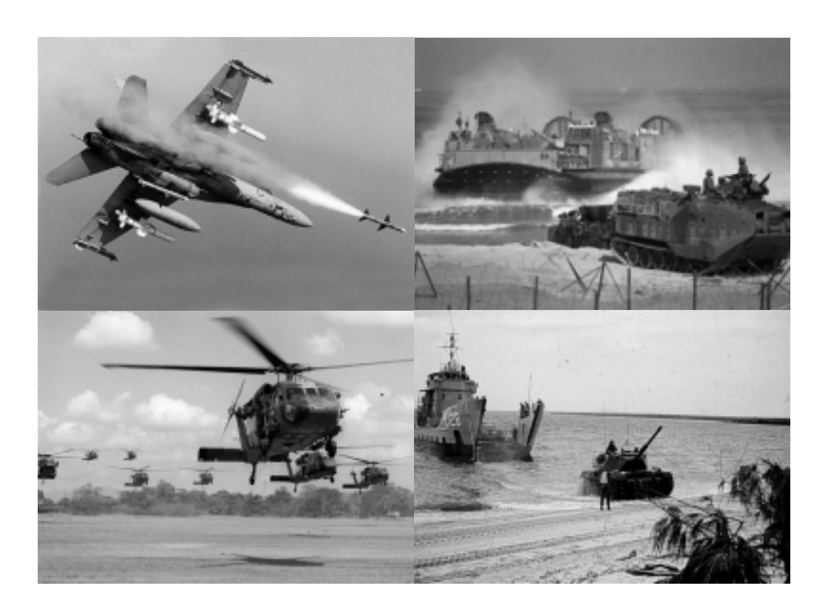
Figure 1.1 A number of typical platforms used in CROC series exercises