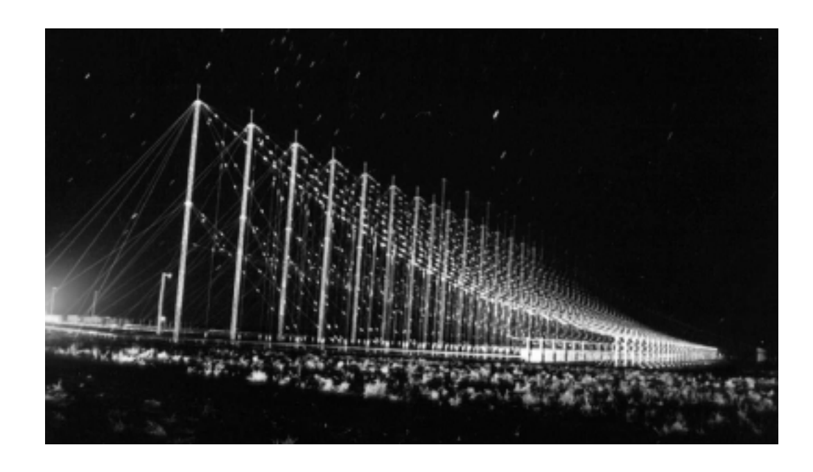
Figure 1.3 JORN over-the-horizon radar receiver antenna array

1.17 The RAAF provides management of operating airspace through coordination of offensive air and defensive air and ground assets. This role is achieved through the networking of surveillance information sources including fixed and mobile Control and Reporting Units, over-the-horizon radar and tactical and domestic air traffic control radars. The Control and Reporting Units provide focal area surveillance that supports effective application of defence systems such as ground based anti-aircraft weapons and counter-air aircraft. Airborne Early Warning and Control aircraft will form part of this capability.