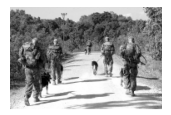
Figure 3.3 Typical patrol by foot and armoured personnel carrier