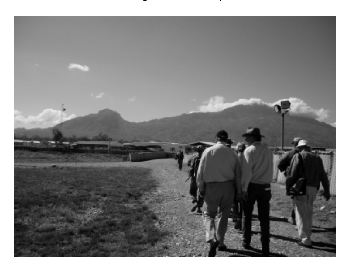
Figure 3.2 Members of the committee entering AUSBATT VIII Headquarters

3.8 AUSBATT VIII is the eighth rotation of Australian Service personnel and is based primarily on the 1<sup>st</sup> Battalion, The Royal Australian Regiment, but includes strong representation from specialist members of the Navy and Air Force.