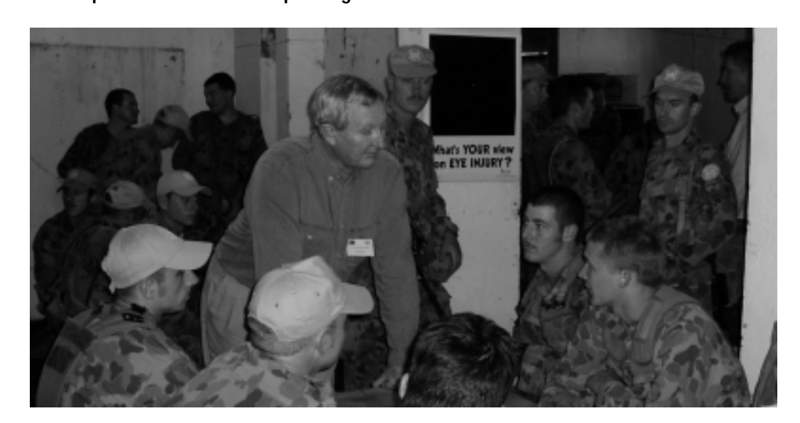
Figure 3.5 ADF personnel at Forward Operating Base Maliana

3.15 The group usually commits one platoon to secure their base, one platoon to patrolling the District, and one platoon to supervising the border crossing. The group is equipped with 4WD troop carrying vehicles and Armoured Personnel Carriers (APC) to move around the District.