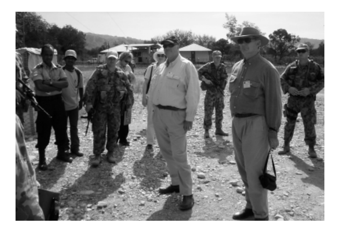
Figure 3.4 Parliamentary members at Junction Post 'Charlie'

3.15 The group usually commits one platoon to secure their base, one platoon to patrolling the District, and one platoon to supervising the border crossing. The group is equipped with 4WD troop carrying vehicles and Armoured Personnel Carriers (APC) to move around the District.