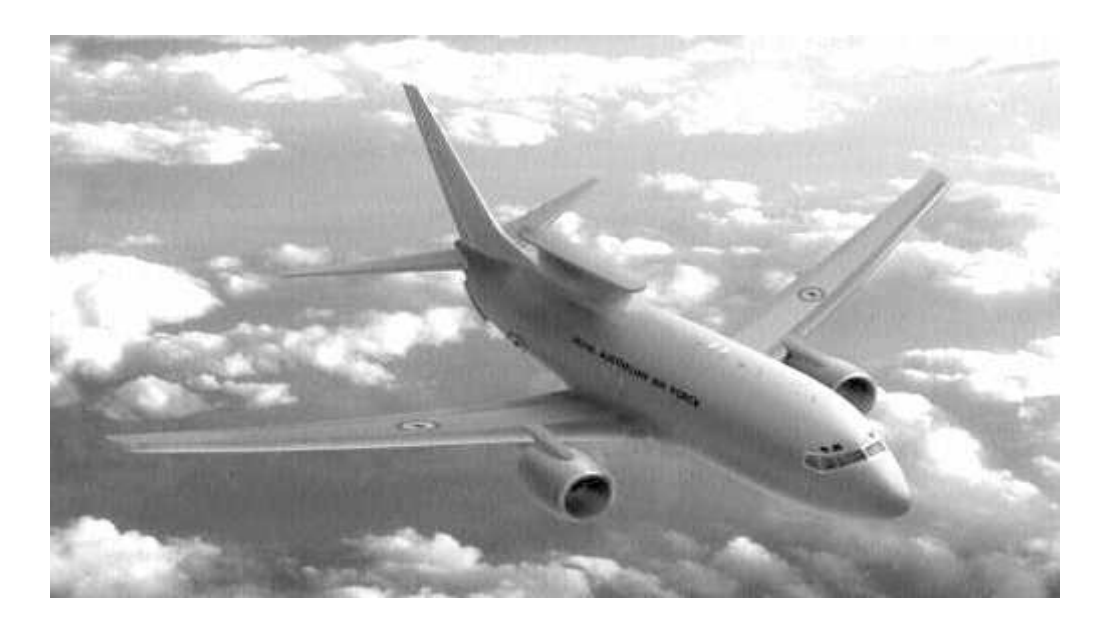
Figure 1.5 Airborne early warning and control aircraft

• the rapid evolution of technology, the lead times associated with major capital acquisition, and the apparent need for an integrated approach.