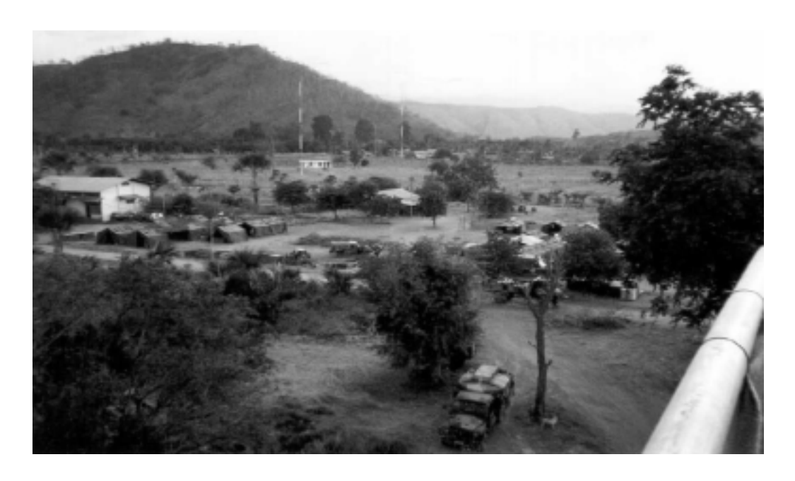
Figure 1.6 381ECSS on deployment