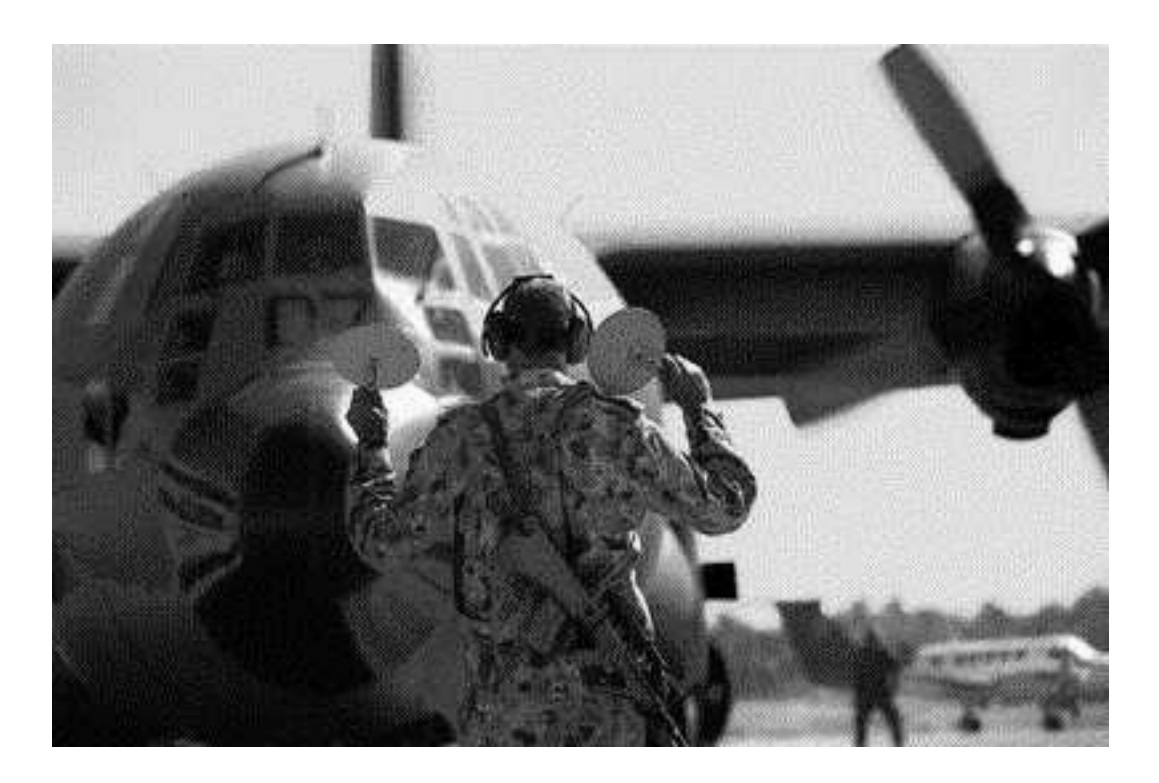
Figure 1.7 381ECSS member marshalling a C-130 Hercules transport aircraft on deployment

1.32 During these operations, 381ECSS personnel were heavily engaged in a range of support activities including defence aid to the civilian community, the activation of bare bases, support to various UN peace keeping missions, support to border protection, support for the coalition force activities in the War on Terrorism, as well as direct support for the War in Iraq.