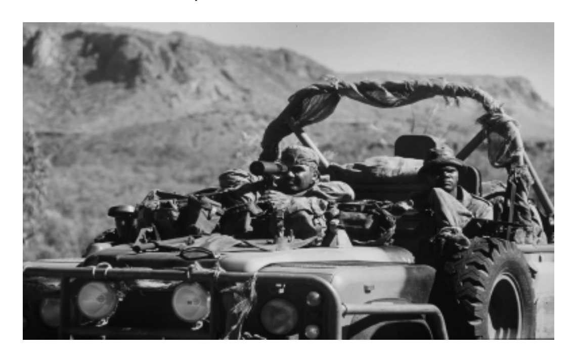
Figure 2.4 NORFORCE observers in operation

2.12 The Regiment maintains squadrons in the Pilbara, Alice Springs and Gove. These are Kimberley Squadron, situated at Broome; Arnhem Squadron, located at Nhulunbuy; and Centre Squadron, stationed in Alice Springs. NORFORCE conducts surveillance and reconnaissance operations in northern Australia within an AR that covers over 1.8 million square kilometres and stretches from the Gulf of Carpentaria in the east to the Kimberley in the west.