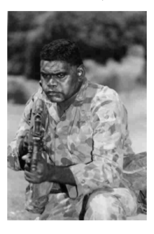
Figure 2.2 NORFORCE members on patrol