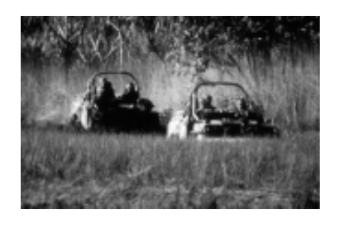
Figure 2.5 NORFORCE deployment by land and sea