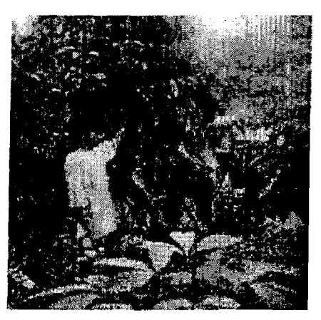
Local people displaced for the establishment of the mine remain dissatisified.

In 1996, Aurora distributed an Indonesian