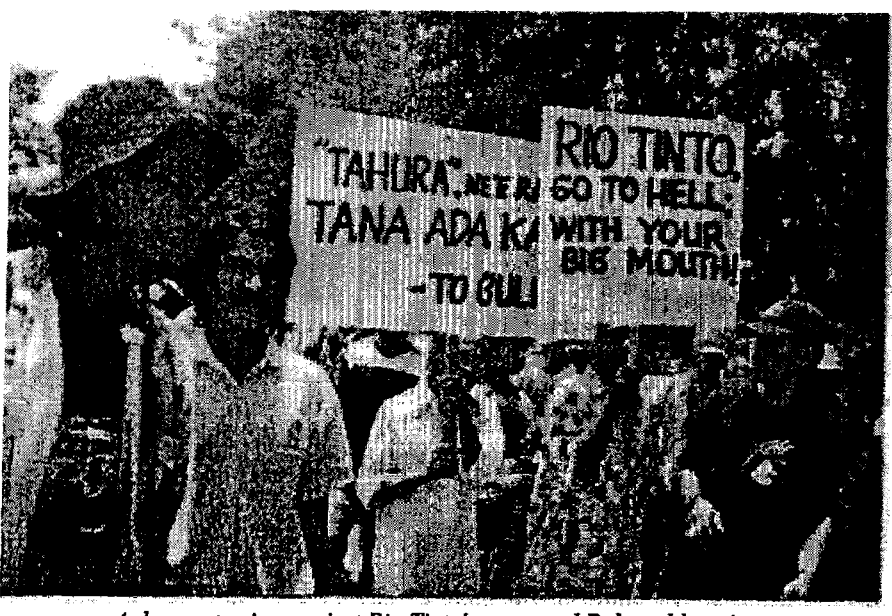
A demonstration against Rio Tinto's proposed Palu gold project in the Poboya Protected forest.

On 9 October 2001, the Indonesian Minis-