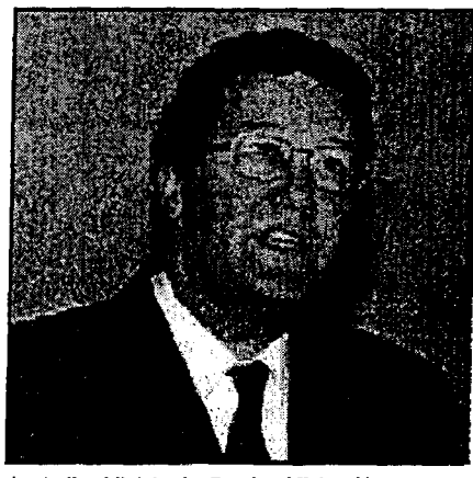
Australian Minister for Foreign Affairs, Alexander Downer.

In answers to parliamentary questions by Australian Greens Senator Bob Brown, the Minister for Foreign Affairs, Alexander Downer, revealed that since November 1999 Embassy officials in Jakarta have worked with Aurora Gold representatives in lobbying Indonesian officials and security forces to eject illegal miners entering the Mt Muro mine.