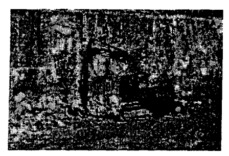
A taste of things to come?: mining of a World Heritage cave.

The workshop proposed that a Working Group on World Heritage and Mining be formed – including and possibly co-chaired by ICME and IUCN – to further develop proposals for ongoing work on the issue