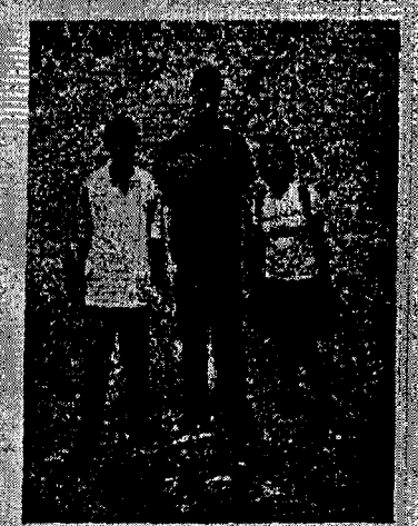
Rio drill hole in Tahura Forest Park

negotiation with the local government to shift the boundary of the park to facilitate mining the estimated resource of 18 million tons of ore. Muhardio does not see any problem with Rio Tinto conducting mining activity in protected areas, including national parks, "as long as government regulations are observed".