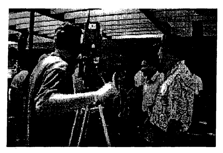
The landowners tour received extensive media coverage.

When the Indo Muro site was owned by US interests in 1987, small-scale miners