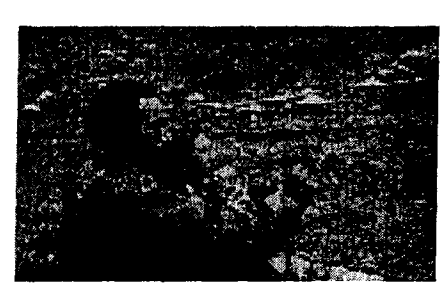
Inspecting the damage to gardens and riverbanks at Banti village.

A short while later, several huge waves of waste swept down the Wanagon River and through the sleeping Banti Village, accompanied by a terrifying roaring noise. Livestock pens and the village graveyard were swept away. Food gardens were swamped and soil along the riverbank stripped away. The flood reached almost 50 metres high, just stopping short of washing out the bridge. Villagers rushed to safety in their hillside church. Miraculously, no-one was killed at Banti.