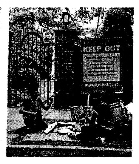
Breakfast protest.

Environmental management is developed through the Analaisis Mengenai Dampak Lingkungran (AMDAL) which requires each project to be assessed. While