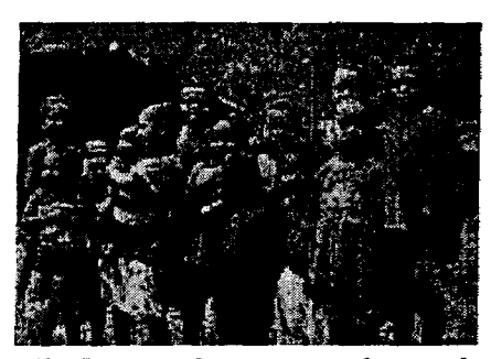
The Wanagon disaster narrowly missed Banti village.

WALHI's lawsuit also alleges that the environmental audit report prepared by US consulting firm Montgomery Watson (MW) for PT Freeport, released in late December 1999, was not properly conducted.