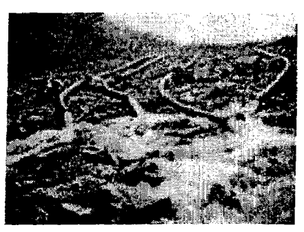
Mt Muro gold mine.

In late September 1999 the controversy over the mine grew. Burston defended Aurora's actions when concerns were raised about the role of the military in dealing with opponents of the mine. "We have a few army people and police that do patrols of the area and are charged with law