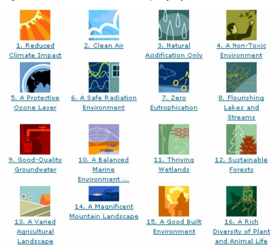
Figure 4.2 Sweden's 16 environmental quality objectives