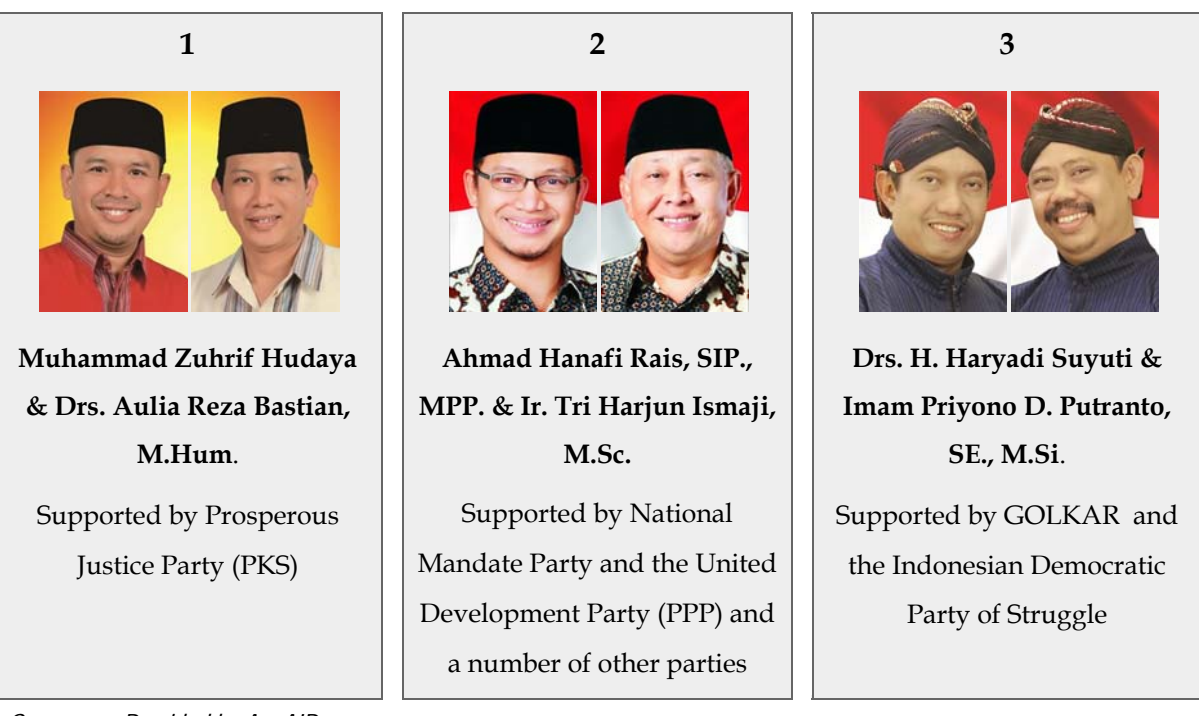
Figure 2.2 Candidates for the Yogyakarta City Head and Vice Head of Local Government

2.36 On Sunday, 25 September 2011 the delegation had the opportunity to observe a local government election held in Yogyakarta to select the Mayor and Vice Mayor of Yogyakarta City. Mayors serve for five year terms. The candidate teams are depicted in Figure 2.2. The election was conducted by the KPU Yogyakarta City.