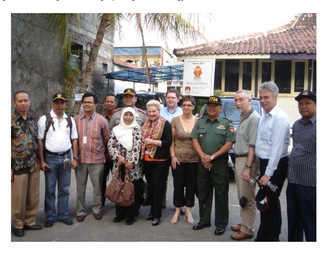
Figure 2.3 Delegation visiting a polling booth in Yogyakarta