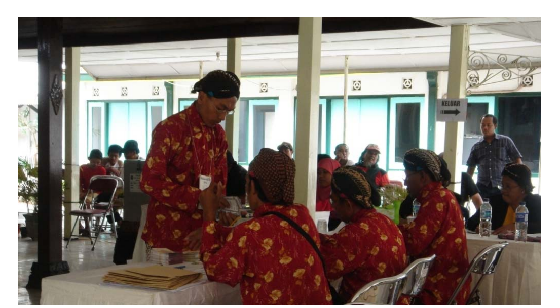
Figure 2.5 Ballot count for the Yogyakarta election