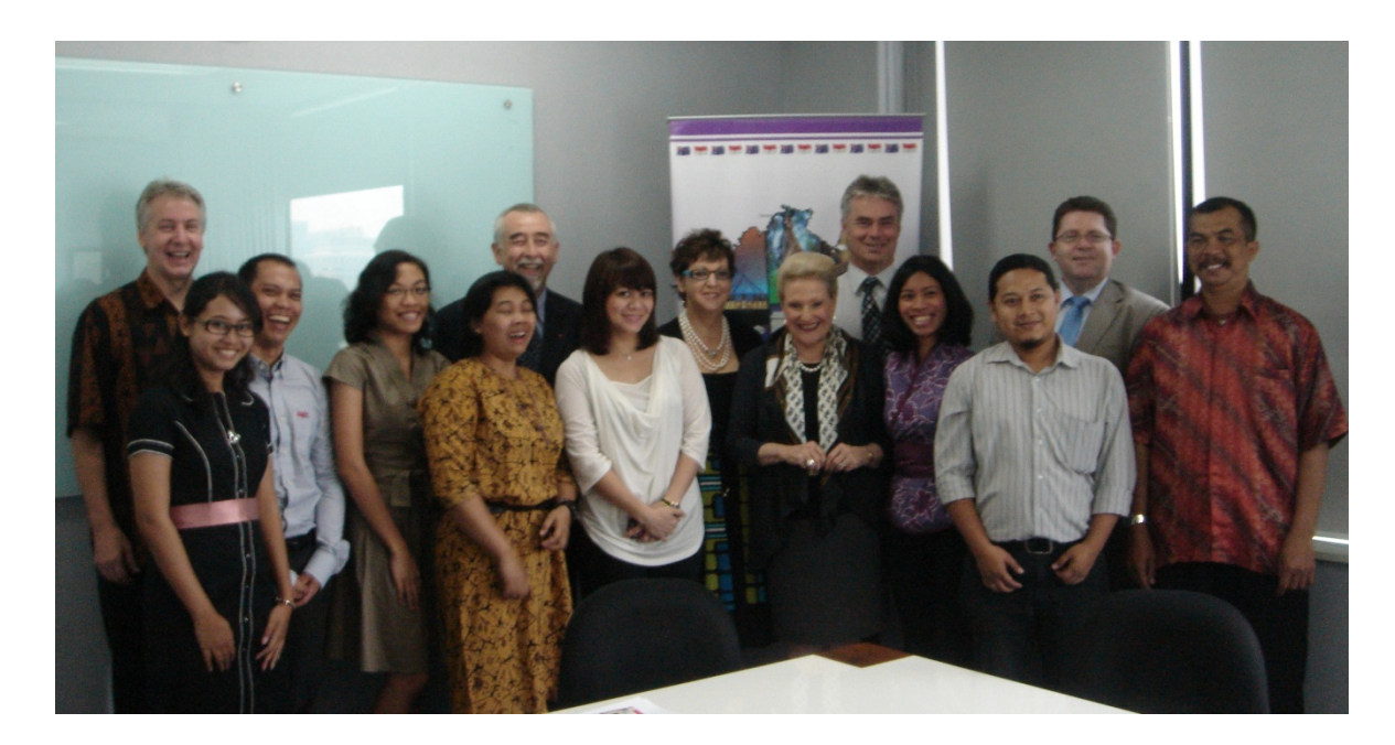
Figure 2.1 Delegation visit to the AEC office in Jakarta

2.35 Recent AEC electoral assistance has included helping KPU to develop and edit a manual for polling station staff at local government elections, which are in the local language. The delegation was provided with copies translated into English. The manual included a detailed outline of the election process and polling staff responsibilities. Appendix B depicts staff roles at polling stations.