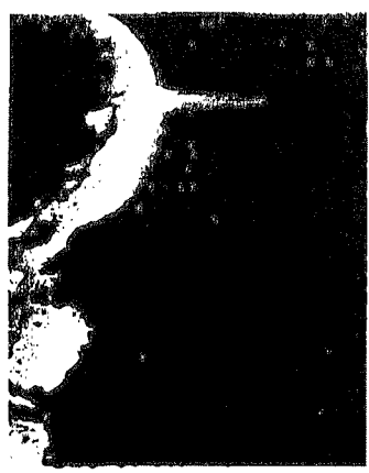
Illegal land clearing near St. Helens