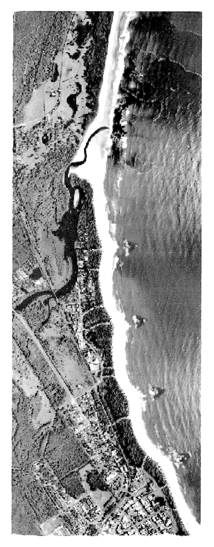
Belongil Beach -Offshore Surf Reefs/Sand Nourishment