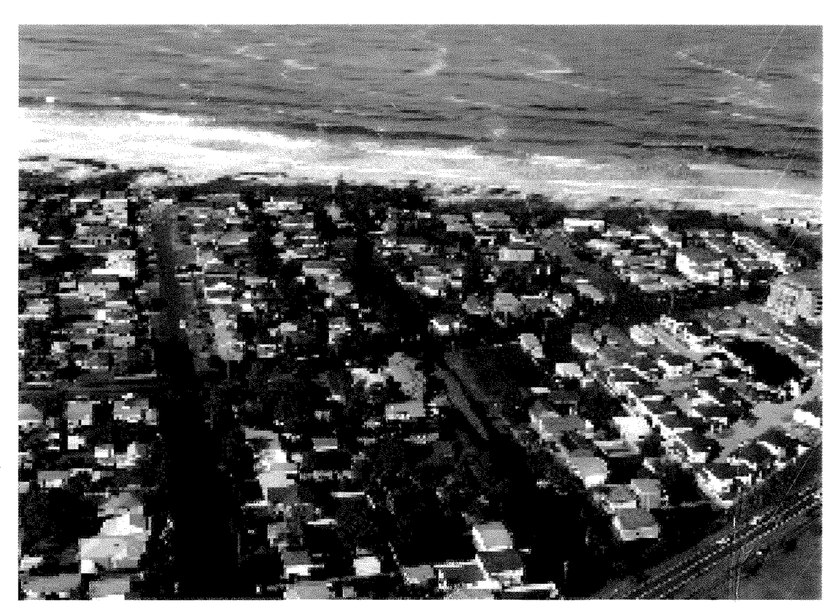
June 2007 Flooding at North Entrance