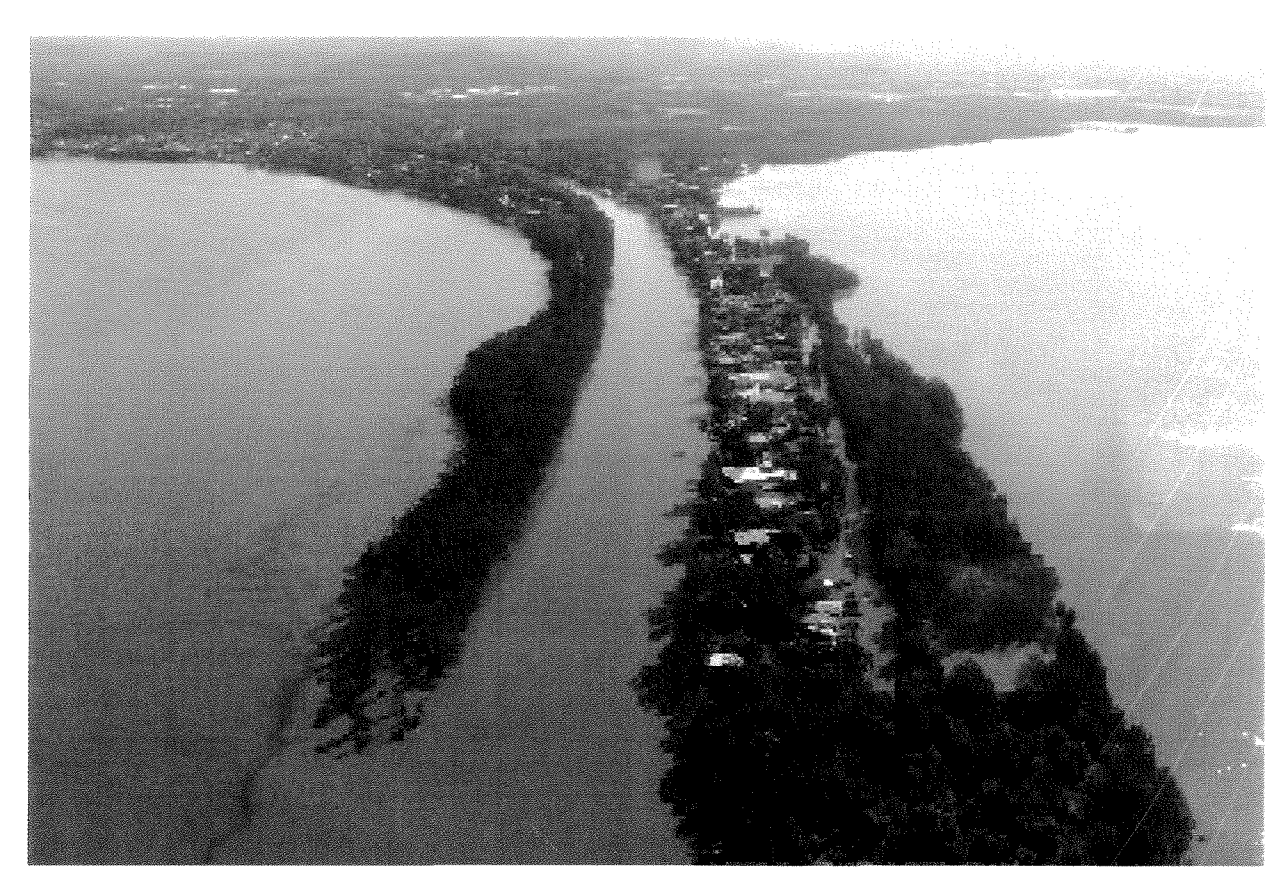
June 2007 Ourimbah Creek