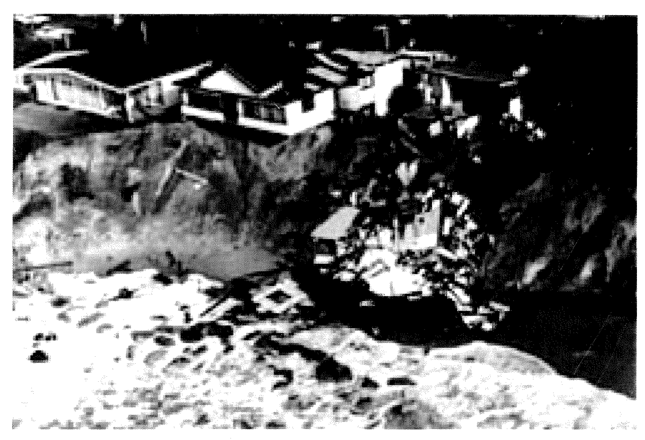
Wamberal Beach 1978

A study for Gosford city Council states "coastal investigations show that the foreshores of the Terrigal/Wamberal embayment have experiences a gradual recession over at least the past fifty years, interspersed with more severe episodes of storm erosion. The identified shoreline recession is ongoing and is gradually exposing the foredune (and development thereon) to more frequent storm erosion events. This has been dramatically demonstrated during the storms in 1974 and in 1978." (Taken from Environmental Impact Statement commissioned by Gosford City council in 2003. NSW Department of Commerce and Manly Hydraulics Laboratory)