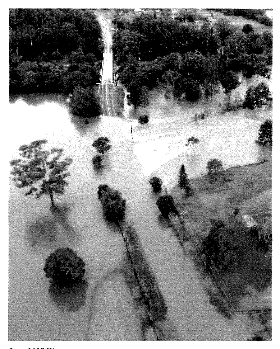
June 2007 Wyong

http://www.clw.csiro.au/publications/technical98/index.html