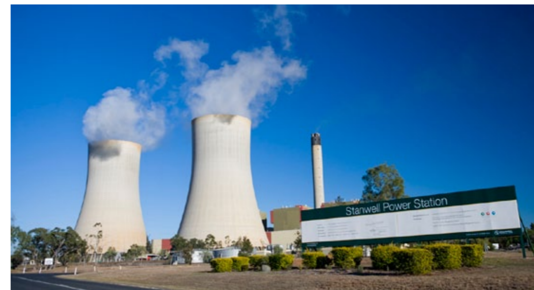
CAPRICORN COAST & ROCKHAMPTON REGION