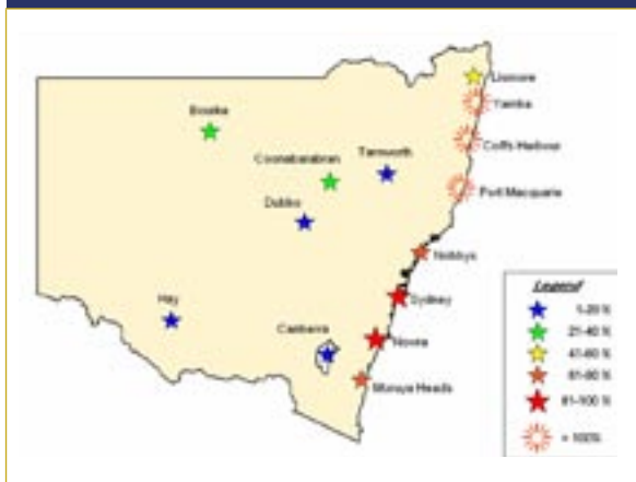
Figure 5. Percentage increases in NSW bushfire risk for El Niño events under IPO negative conditions compared to El Niño events occurring in non-negative IPO phases (see Verdon et al. (2004a) for further details).

Figure 5 shows the percentage increase in bushfire risk when IPO negative El Niño events are compared with all other El Niño years. In comparison to Figure 3 (where all El Niño events were compared with non-El Niño events and it was shown that bushfire risk is elevated during El Niño events) it can be seen that IPO negative El Niño events are associated with an even greater risk of bushfire than the non-IPO negative El Niño events. This supports the notion that the magnitude of ENSO impacts is enhanced during periods when the IPO is negative and implying that bushfire risk is extremely high during IPO negative El Niño events when compared to all other years.