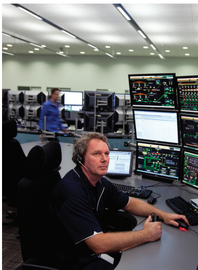
Mine of the Future

Rio Tinto is a strong supporter of the Extractive Industries Transparency Initiative (EITI) which was established in 2003. It has been developed as a multi-stakeholder initiative and includes in-country programmes as well as being governed through a global Board and Secretariat.