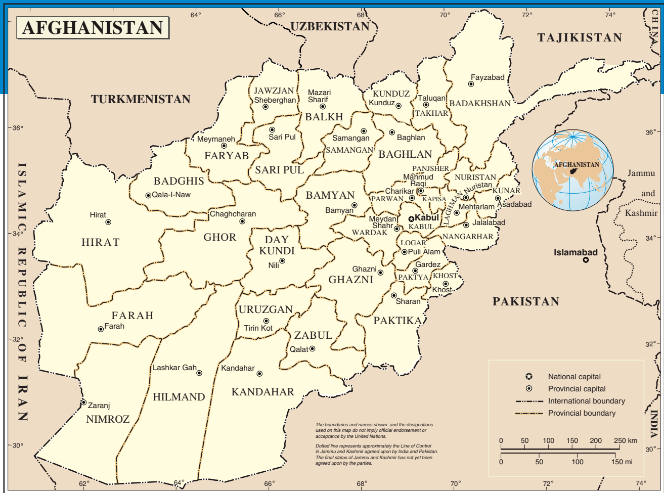
Map No. 3958.1 Rev. 2 UNITED NATIONS July 2009