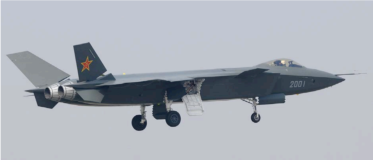
Prototype of the Chinese Chengdu J-20 supercruising high agility stealth fighter. The aircraft is now entering production, and was developed to compete with the US F-22A Raptor.