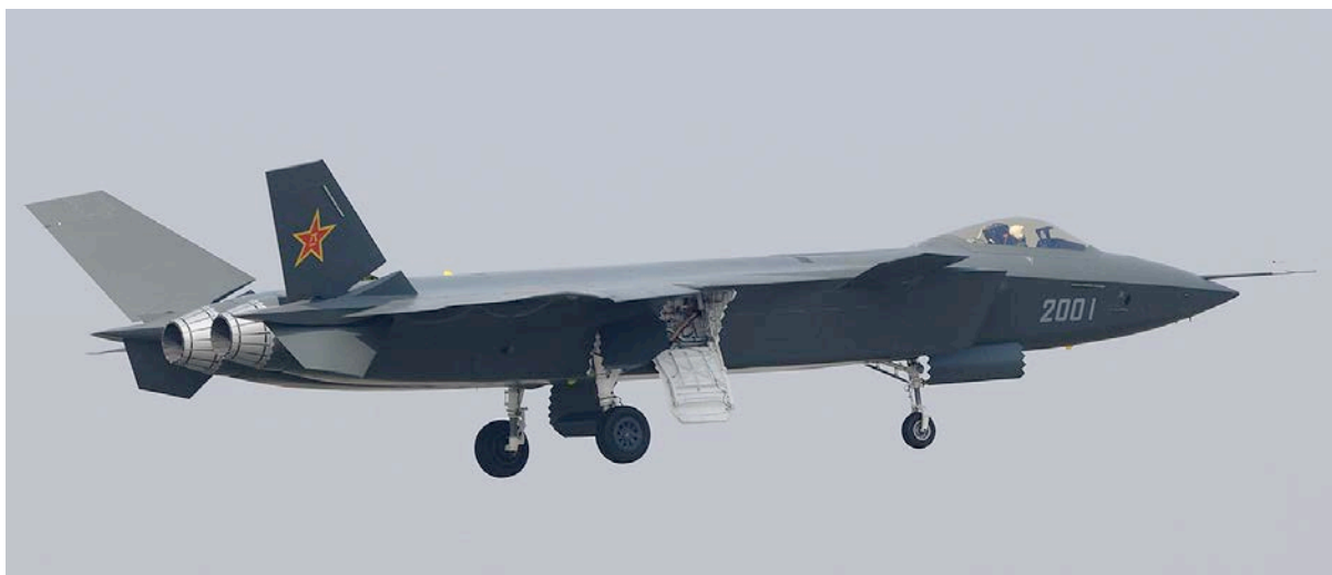
Prototype of the Chinese Chengdu J-20 supercruising high agility stealth fighter. The aircraft is now entering production, and was developed to compete with the US F-22A Raptor (PLA).

Chengdu J-20 0000 Ohms/sq. @ 08.00GHz IncPol:TM Pol:Theta Elev=045.0 Azm=225.0