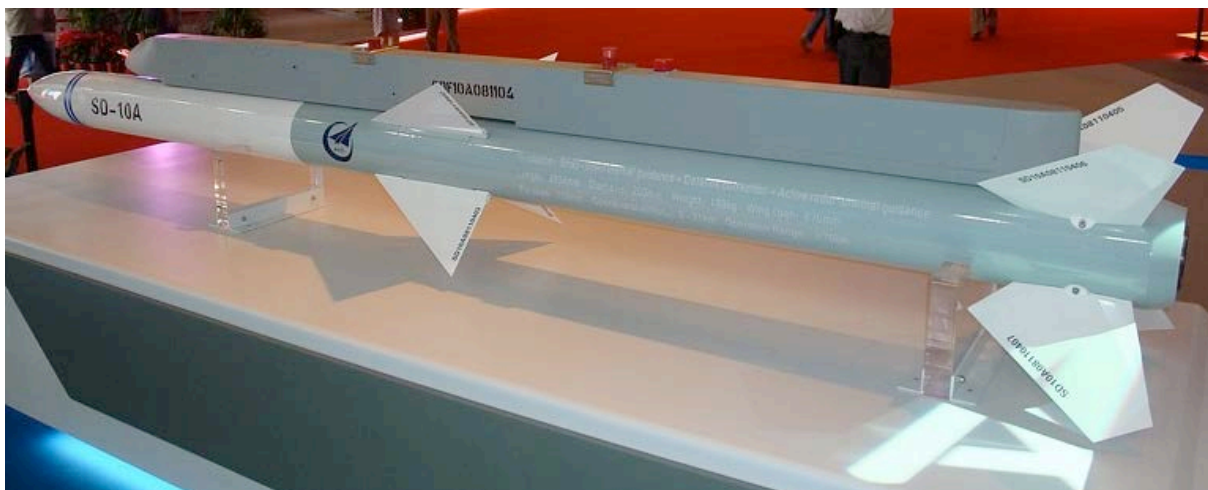
The Chinese LETRI SD-10/PL-12 “Sino-AMRAAM” is modelled on the US AIM-120 AMRAAM. Variants employ Russian Agat 9B-1348E active radar seekers, and a newer Agat dual mode seeker, providing also passive anti-radiation homing capabilities.