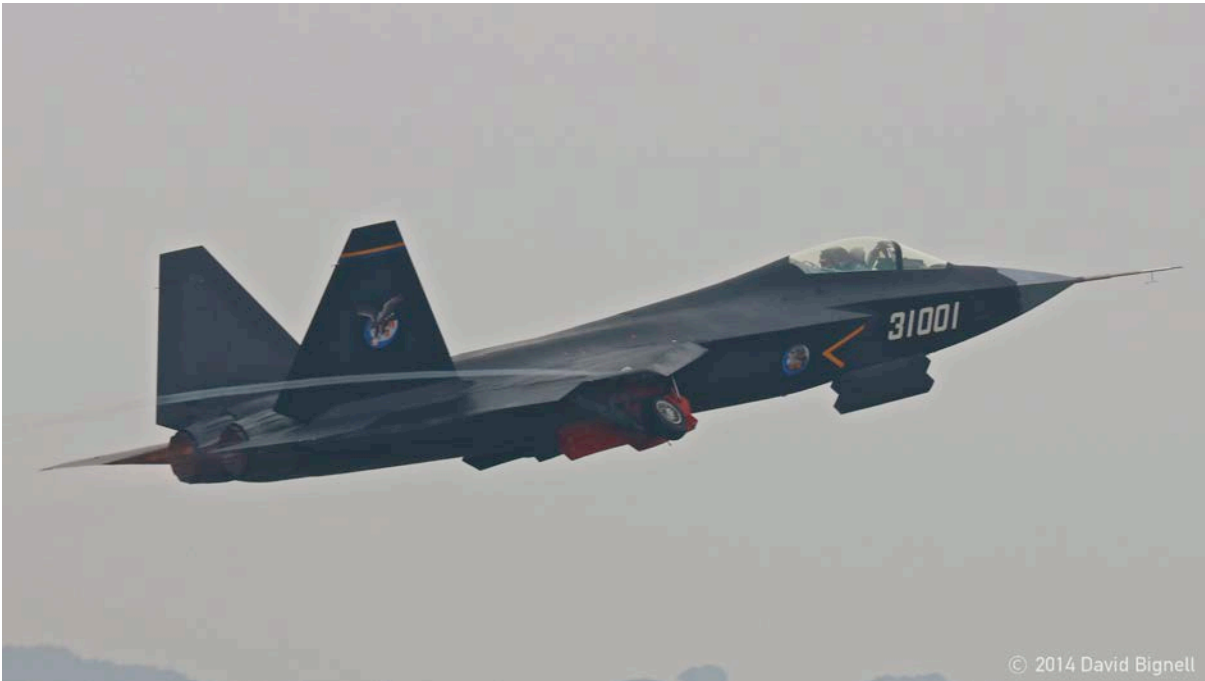
Above, below: Shenyang J-31 prototype at the 2014 Zhuhai air show. This Chinese stealth fighter is commonly described by Western media as a copy of the F-35, but key stealth and aerodynamic features appear to be borrowed from the F-22A Raptor.