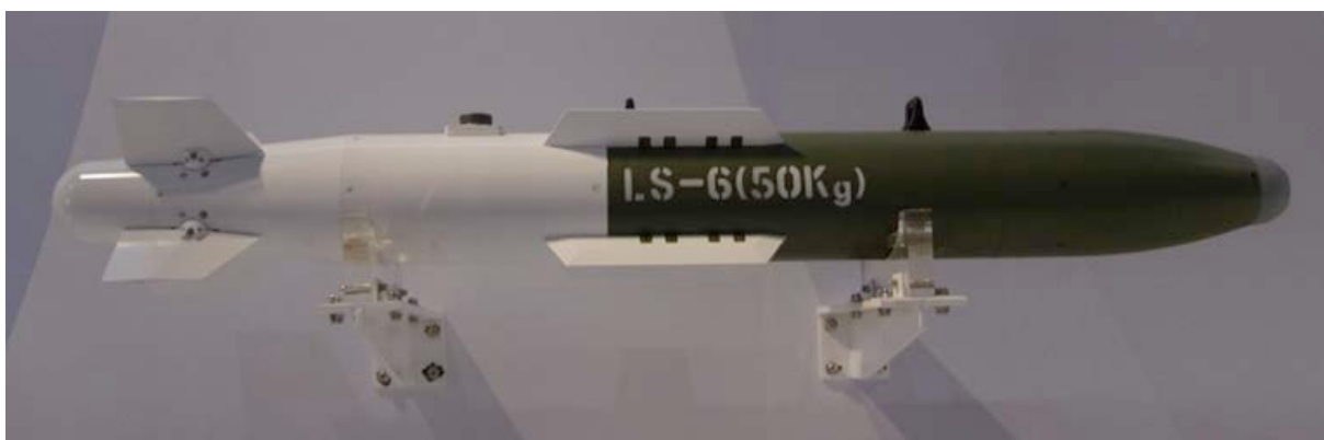
Chinese Luoyang/CASC LS-6 Small Diameter Bomb. This weapon is similar in configuration to the US MMTD demonstrators for the GBU-39/B Small Diameter Bomb.