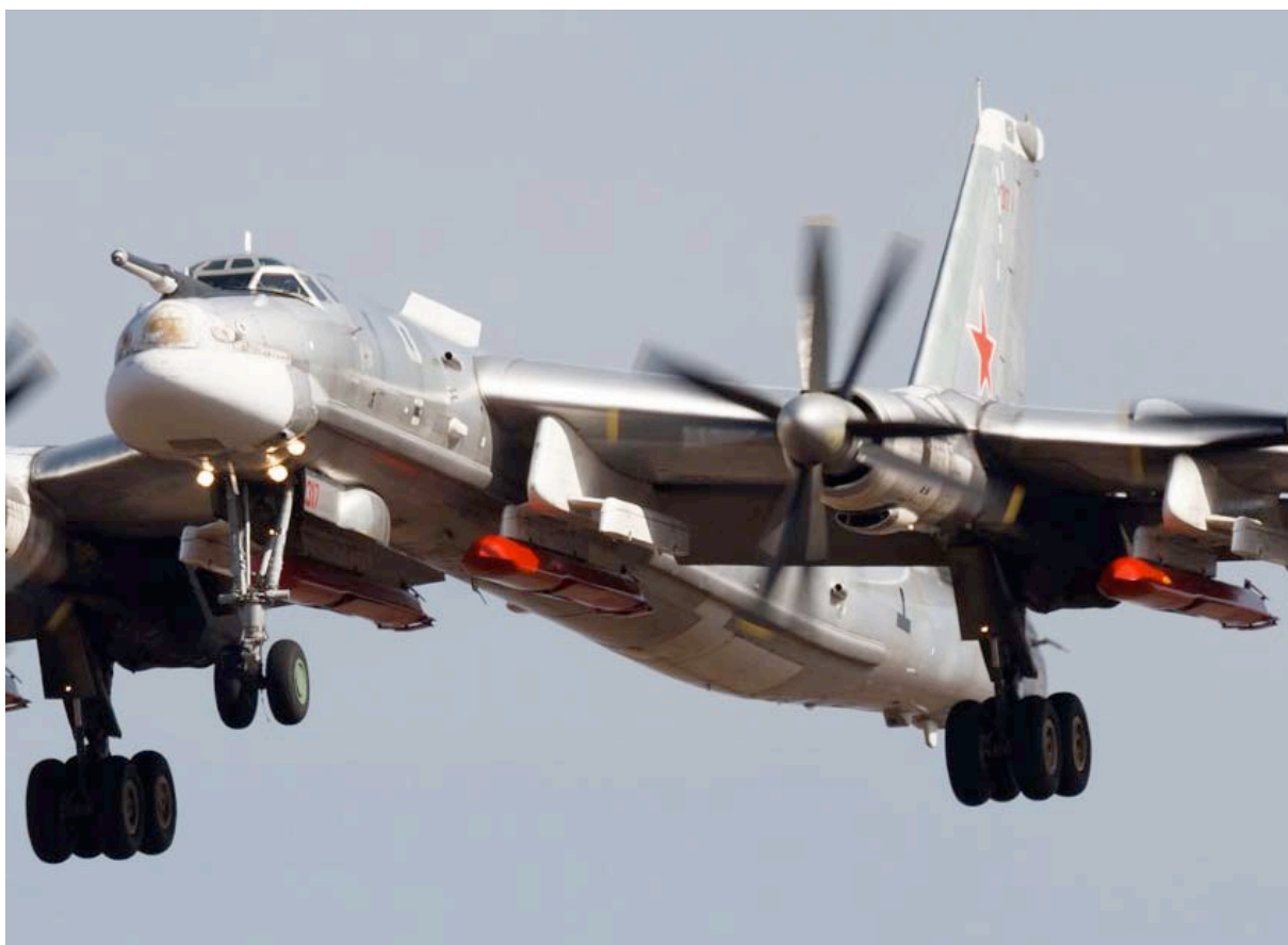
Russian Raduga Kh-101 low observable long range cruise missile during trials, carried by a Tu-95MS BEAR H. This stealthy cruise missile has been used repeatedly to attack targets in Syria (Anatoliy Burtsev).