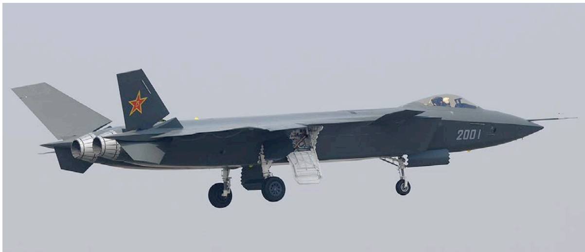
Prototype of the Chinese Chengdu J-20 supercruising high agility stealth fighter. The aircraft is now entering production, and was developed to compete with the US F-22A Raptor.

Chengdu J-20 0000 Ohms/sq. @ 08.00GHz IncPol:TM Pol:Theta Elev=045.0 Azm=225.0