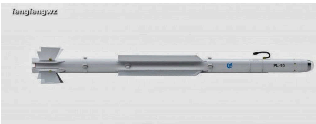
Chinese Luoyang PL-10 close combat missile, observed on the J-20. This is missile is reported to be a derivative of the Ukrainian Luch Gran, itself modelled on the MBDA Iris T missile (Chinese Military Review).