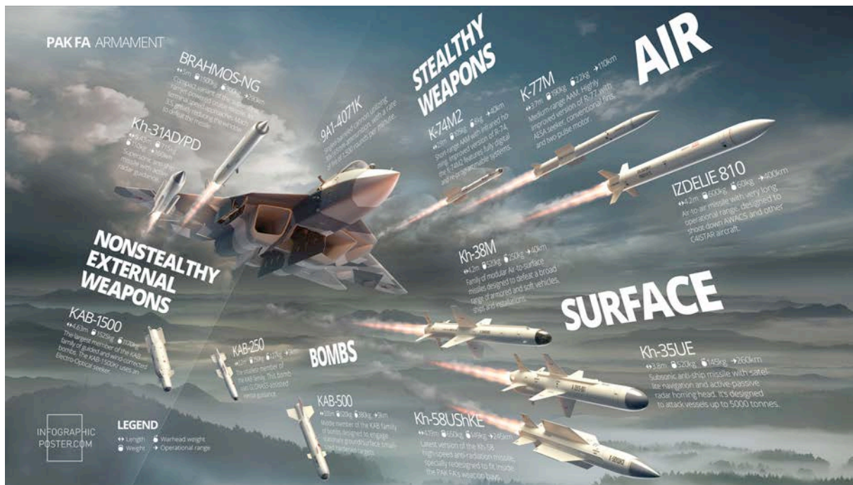
Manufacturer's graphic of Sukhoi/KnAAPO Su-50 / T-50 PAK-FA weapons capabilities. Not depicted are the Grom E1/E2 Small Diameter Bombs, and the low observable Kh-59Mk2 stand-off missile (UAC Russia).