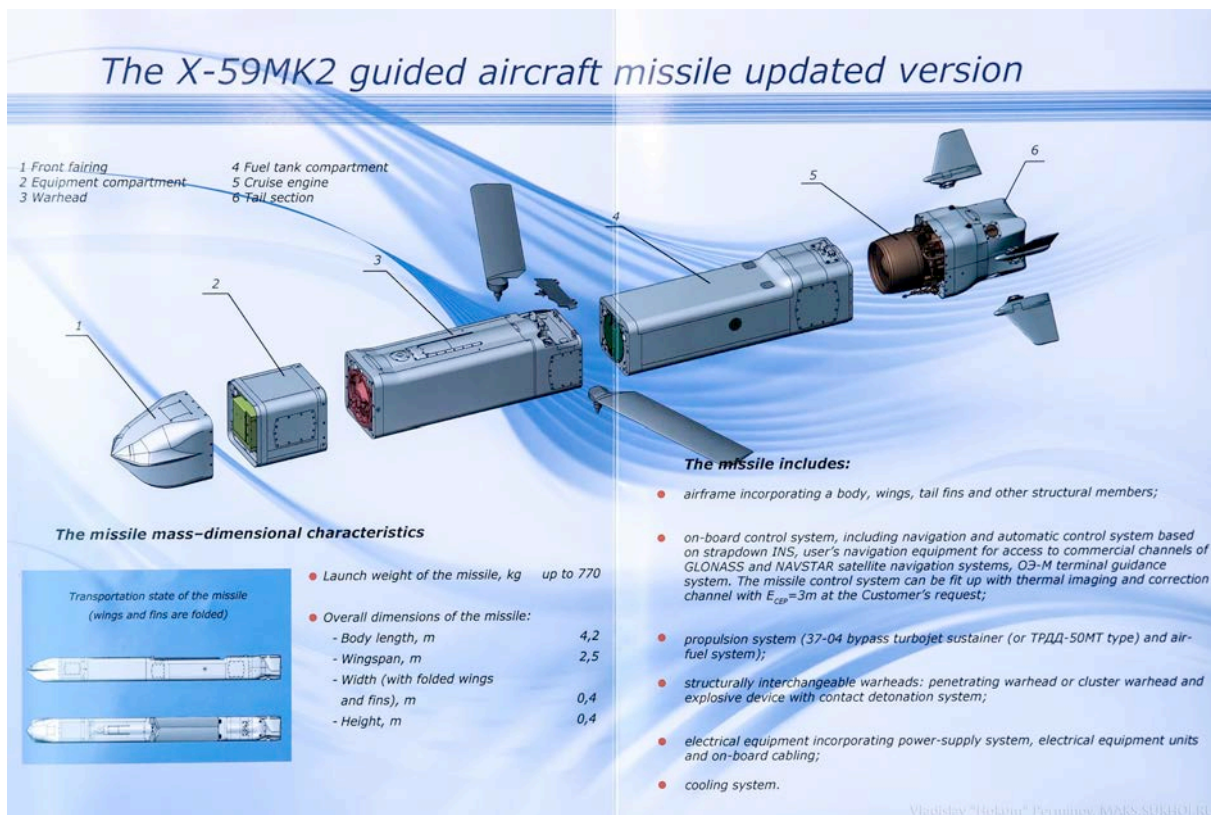
Russian Kh-59MK2 low observable stand-off missile, intended for internal carriage (TMC Russia).