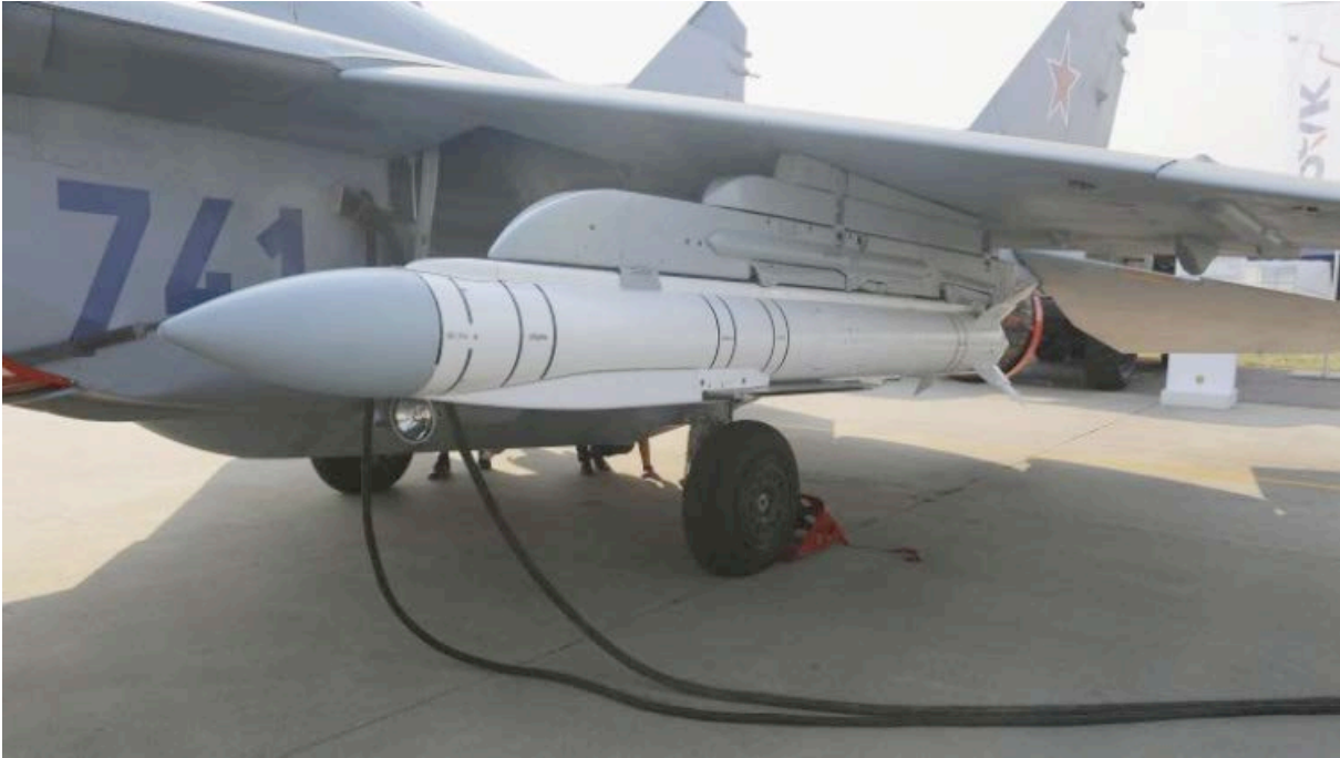
The Russian KTRV Grom E1/E2 glide-bombs are modelled on the US Small Diameter Bomb, but one variant has a motor to increase stand-off range (IHS Janes).