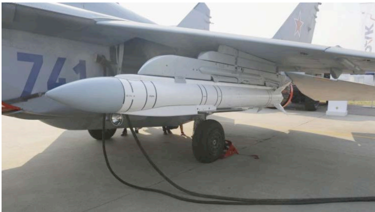
The Russian KTRV Grom E1/E2 glide-bombs are modelled on the US Small Diameter Bomb, but one variant has a motor to increase stand-off range.