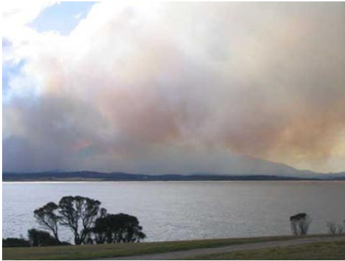
Gulaga (Mt Dromadery), 2009: on fire due to foresters' carelessness.