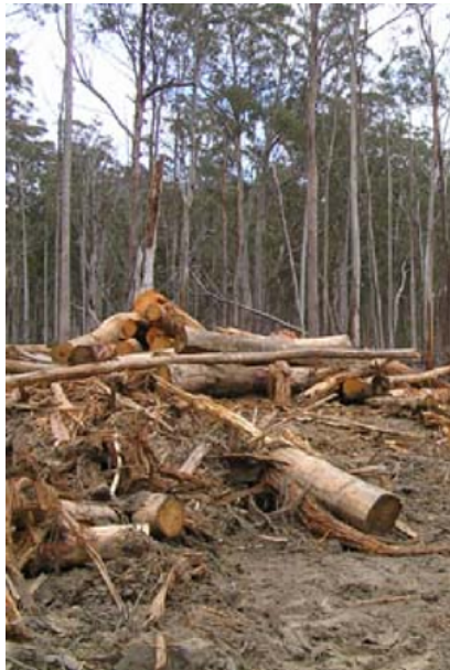
Buckenbowra State Forest, 2009