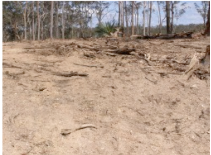
Clear felling near Mogo , 2009