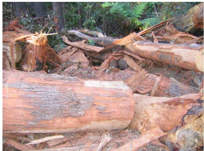
Mumbulla State Forest, 2010: illegally logged as it is Aboriginal sacred ground and koalas had been sighted there.