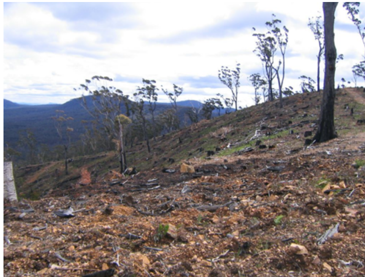
Gnupa State Forest, 2009: FNSW acknowledges this was a 'mistake'.