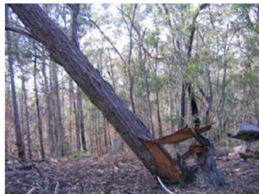
Bermagui State Forest, 2009: post logging burn

The 'felling fields' look like eco-terrorism war zones. While I cannot claim to have an in depth scientific knowledge about koalas and their habits and habitat requirements, it seems obvious that the opportunities, which these pictures convey for their health and sustainability, are negligible.