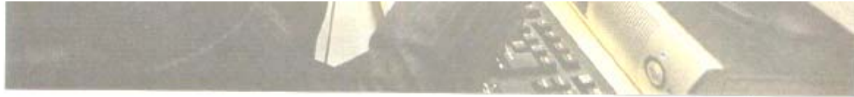
HANDS ON: Deputy Prime Minister Julia Gillard goes back to school on Thursday after the early-morning launch of the My School website.