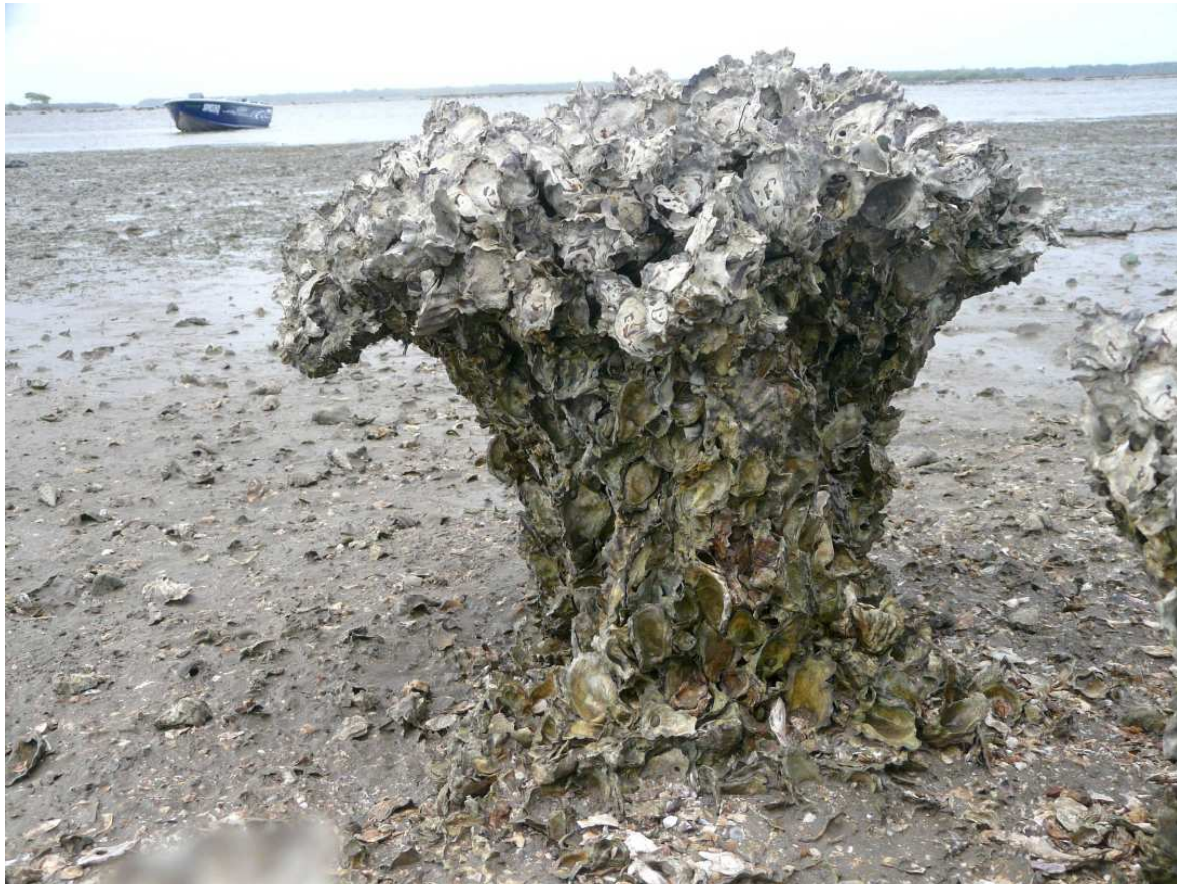
Figure 2. Decades old oyster clumps at the mouth of Pumicestone Passage, Moreton Bay Marine Park, in January 2011. The formerly monolithic structures are now mushroom shaped, as they decay from the bottom up due to oyster death and spatfall failure due to declining water quality. A rare visible indicator of larval recruitment failure in the marine environment.

all areas was being adversely (and severely) affected by environmental degradation due to poor water quality stemming from adjacent land use and urbanization, as demonstrated by the aforementioned loss of macrobenthic fauna, seagrasses, mangroves, and oysters, including losses of all these in areas of Pumicestone Passage where Pillans et al. (2005, 2007) conducted a significant proportion of their studies (Diggles 2011, Figure 2).