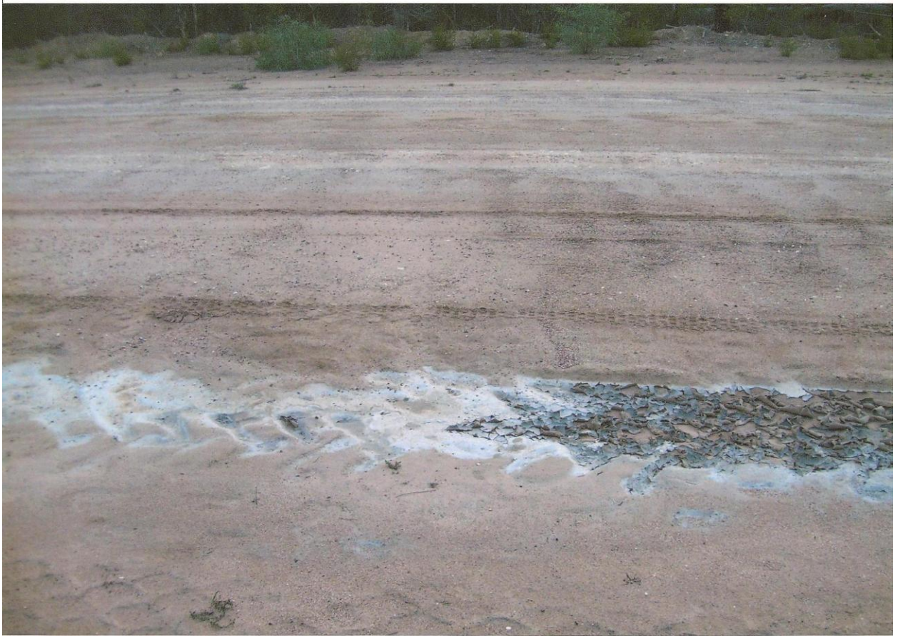
1 Deposits of salt after water was dumped into our creeks and on the roads.