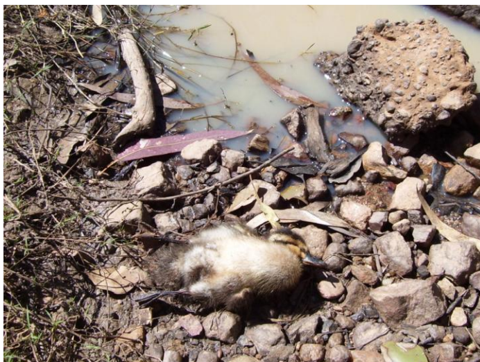
1(c) a dead duck that you could assume drank from the water run off