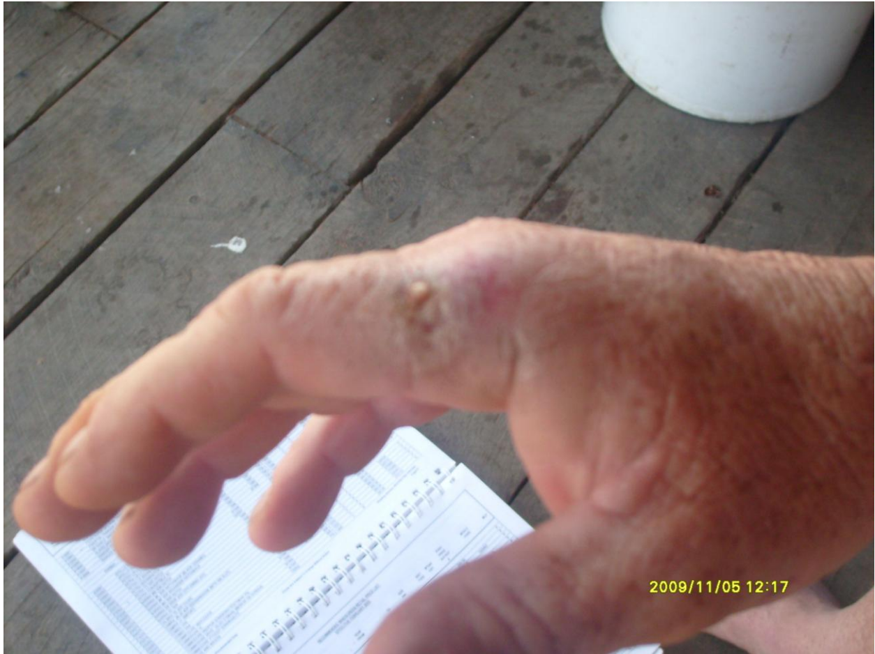
Resident hand after coming in contact with water dumped on our roads