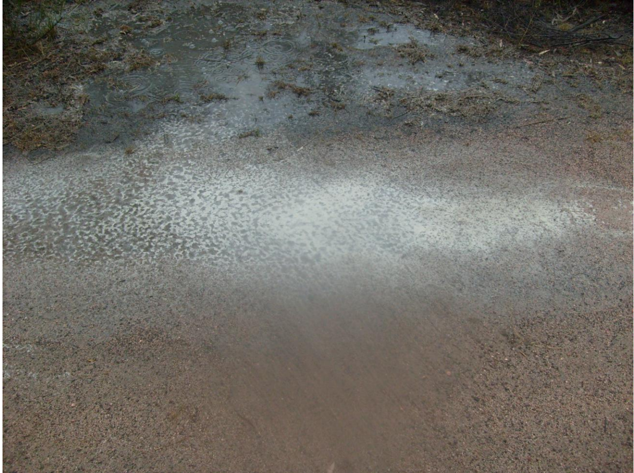
1(b) Deposits of salt after water was dumped into our creeks and on the roads.