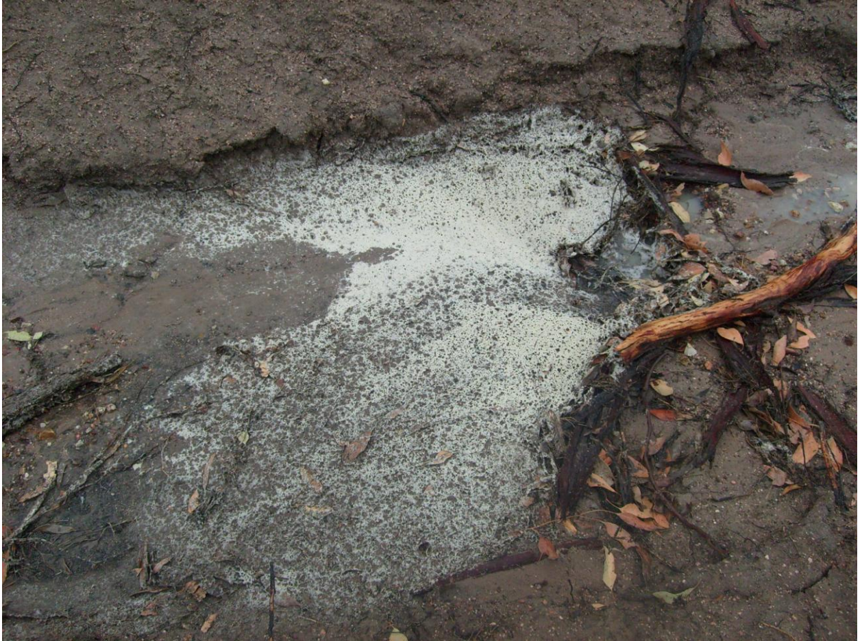
1(a) Deposits of salt after water was dumped into our creeks and on the roads.