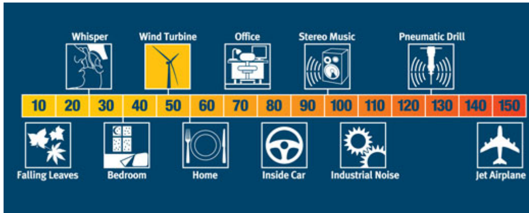
Figure 1: Sound pressure levels of wind turbine compared to other common sources ( www.canwea.ca/wind-energy/myths_e.php )

Wind turbines like all other mechanical equipment generate sound. A relative comparison of the sound from a wind turbine at 350m is given in Table 1, figures are Sound Pressure Levels. The sound generated by a wind turbine covers a broad spectrum of frequencies including infrasound and low frequency.