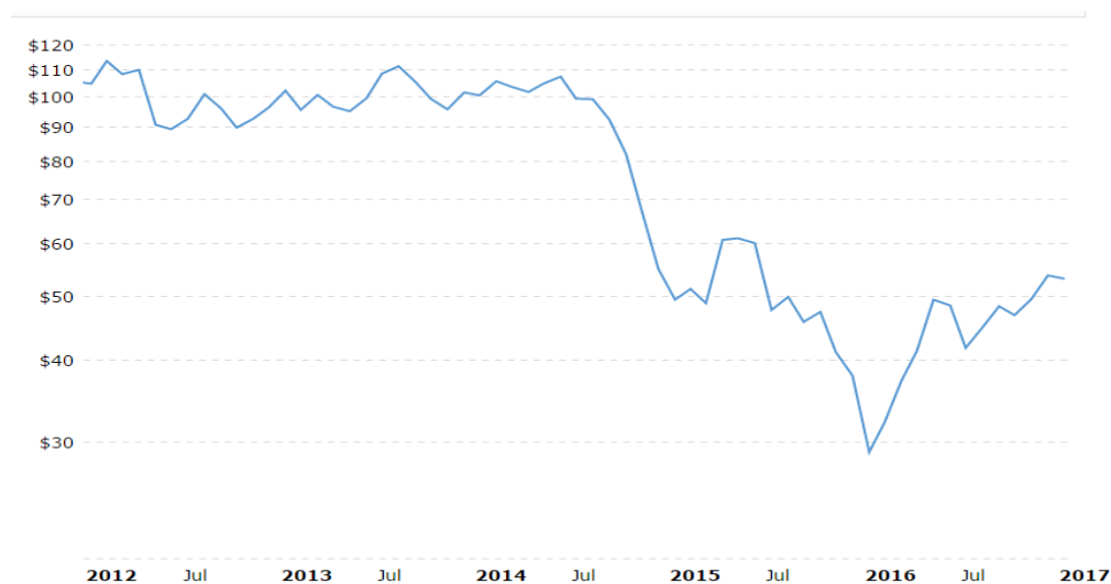
Chart 1 – Crude oil prices historical chart 52