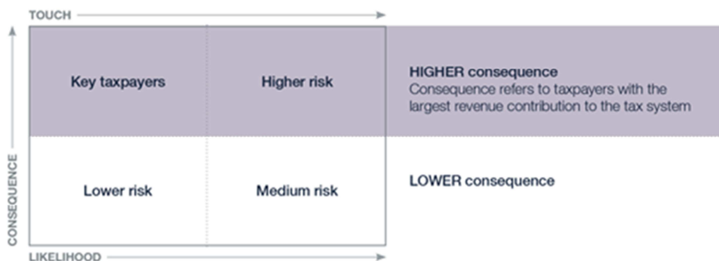
Figure 1: Risk-differentiation framework – four quadrant model