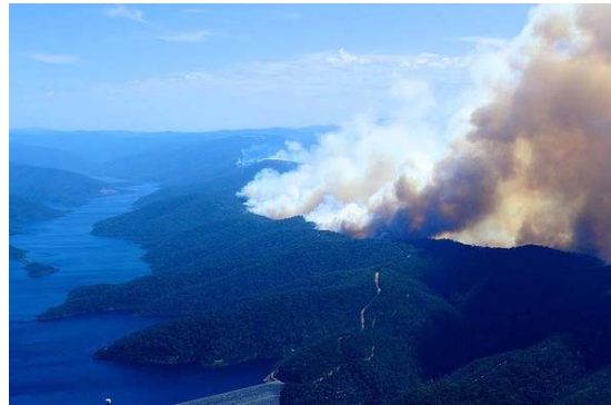
The Aberfeldy range where the fire raced along the firebreak with extreme heat intensity and speed. This fire was burning in burnt forest from the 2007 fires.

This submission only touches on the tip of the iceberg. There has never been a more critical time in history to act on these points than right now. We are already 30 years behind on this essential work.