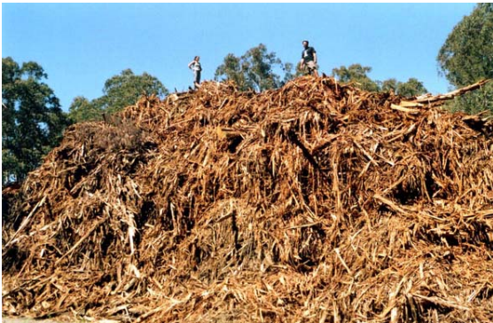
The logging slash piled along a fire break. It aids the wind tunnelling effect.

The boys club mentality must be reined in and managers with understanding of fire behaviour replace old foresters. The politics of fire must not override public safety. The ecology must not pay the price of maintaining an empire based on politically motivated fire management.