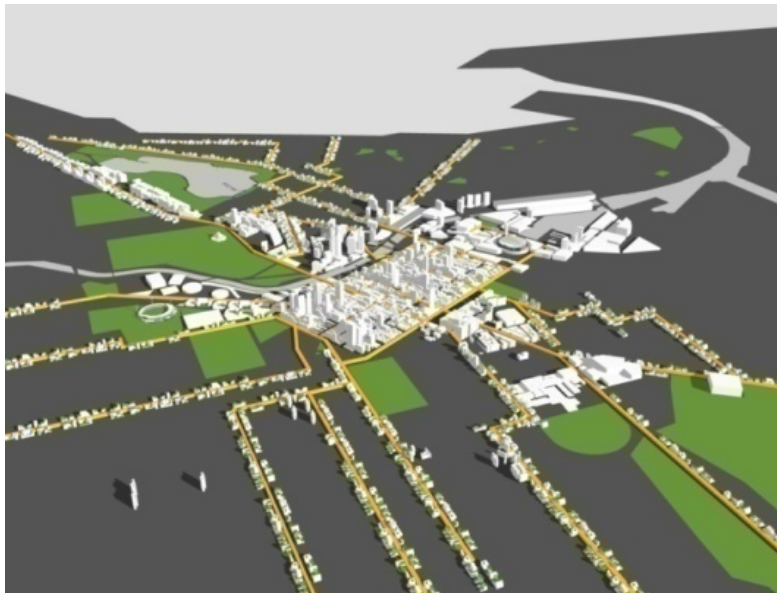
Figure 2: Inner Melbourne with potential linear corridors.

Easy pedestrian access to rail and bus routes, with stops that provide shelter, are basic requirements to attract people from their cars and reduce traffic congestion. The following diagram from Professor Adams illustrates how this might appear in a city like Melbourne.