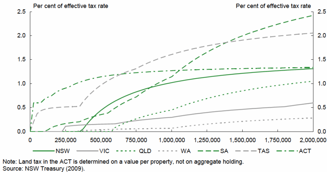
Chart C2-6: Thresholds and average rates of land tax

Some may argue that Land Taxes should first replace Stamp Duties. In terms of efficiency dividends, that may well be more amenable. However, Land Taxes need to send a signal to the market that they will be increased over time – that the days of unearned incomes in this age of entitlement are over.