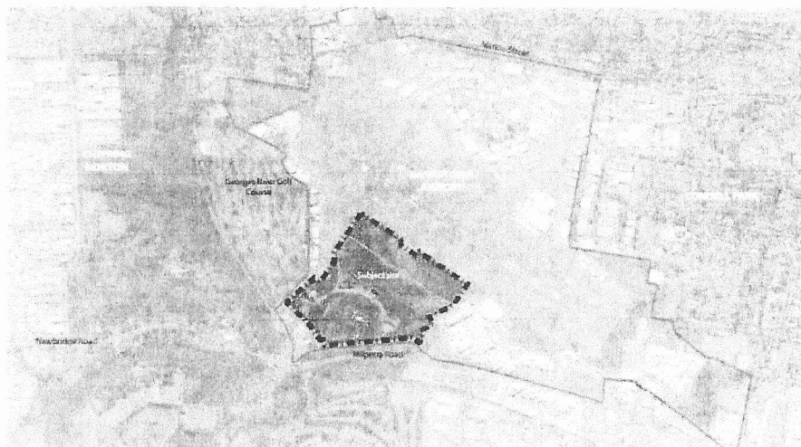
The Bankstown Airport site

With the state government considering new transport links to the area, a company owned by billionaire property investor Bob Ell is teaming up with the airport to put forward a plan for what they are calling the "Bankstown Business Estate" .