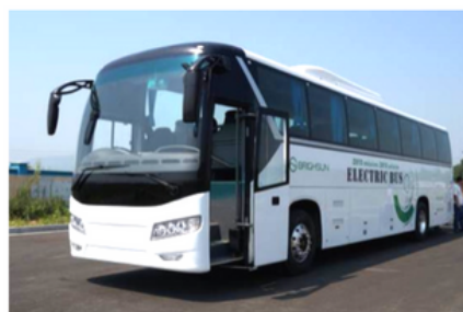
1. Beyond Zero Emissions November 2016

A dedicated rapid charging and charging infrastructure for a national electric car and bus fleet is included in the projected costs as is the cost of new-build renewable electricity on the grid.