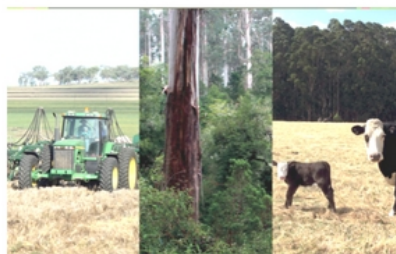
1. Beyond Zero Emissions April 2017