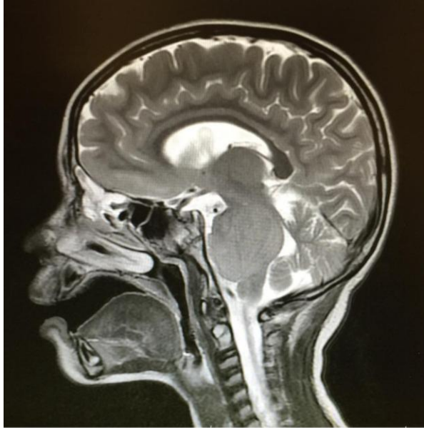
MRI - DIPG growing in brain