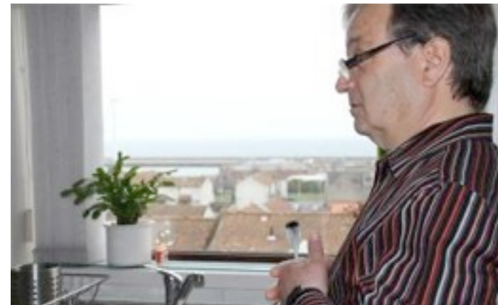
Town Council Member, Scotland