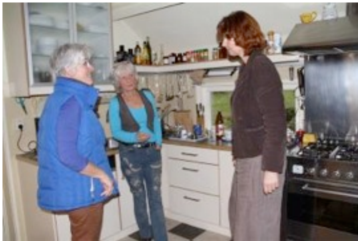
Home Owners - Netherlands