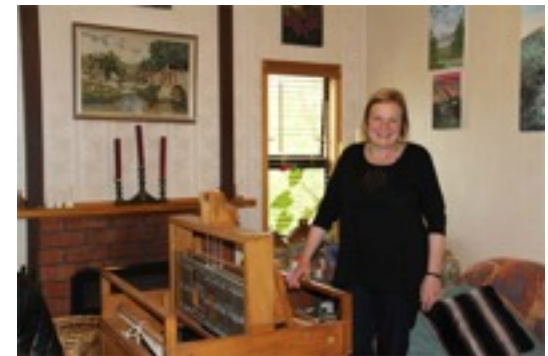
Farmer/Artist – NZ