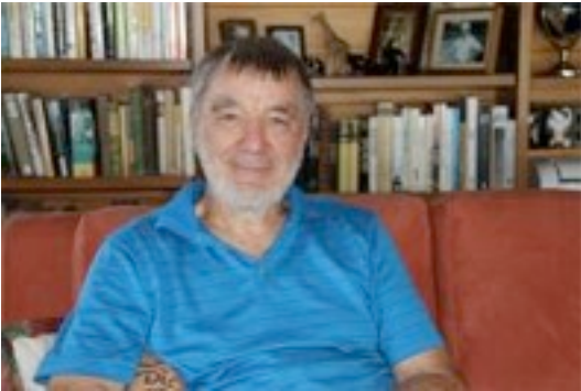
Economist – New Zealand