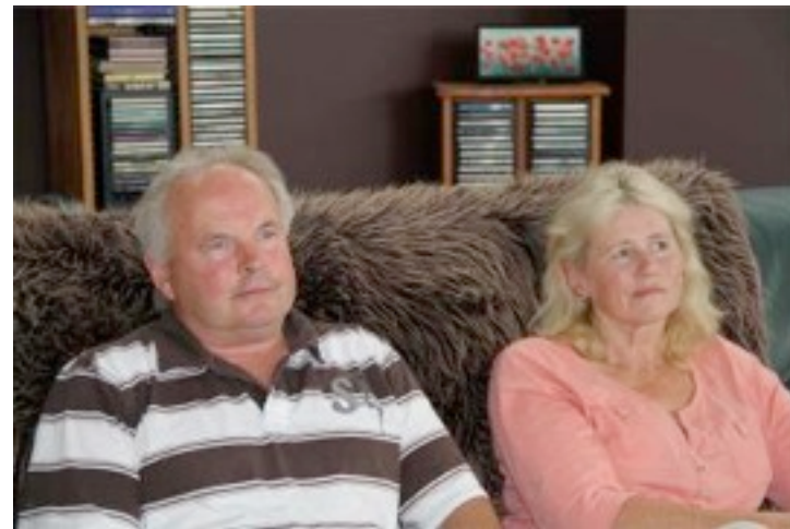
Multi-property Owners - NZ