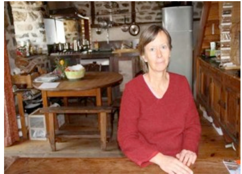
United States, France and Australia