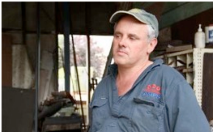
John Madigan, Federal Senator, AU