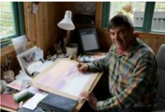
Artist - Wales