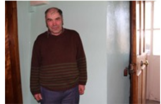
Farmer - France