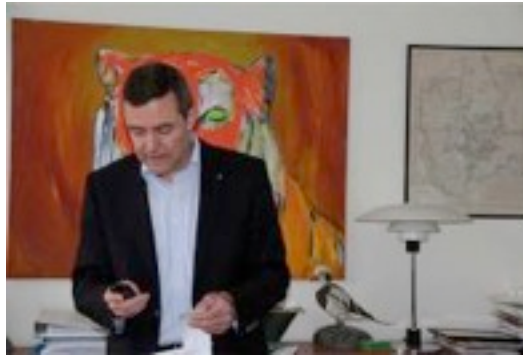
Attorney - Denmark