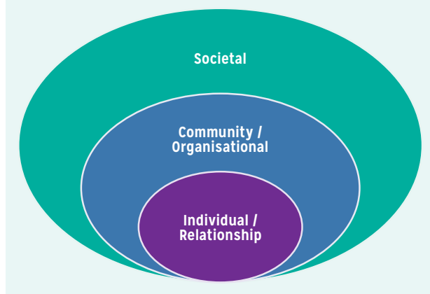
FIGURE 1: AN ECOLOGICAL APPROACH TO UNDERSTANDING VIOLENCE AGAINST WOMEN

The Ecological Model suggests that the problem of violence against women is essentially one of culture and environment, rather than one of deficits in individuals. Solutions involve changing social norms and behaviours, and require the active involvement of all levels of the community. The premise of this model is that violence is a function of the abuse of power and control, and it aims to bring about social change to create an ethical setting where individuals are not exploited, power is not abused and all members of a community are involved (Maton, 2000). It has been argued that this model has the capacity for social transformation in individual and community values and norms. Change depends on interventions occurring at multiple levels ranging from individuals through to society, and from society down to the individual (Dyson and Flood, 2008). In this model: