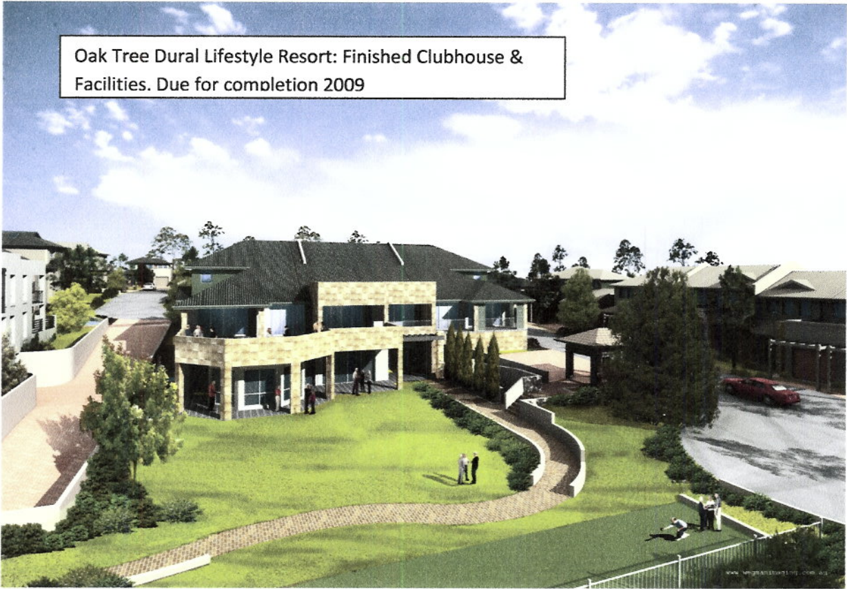
Oak Tree Dural Lifestyle Resort: Finished Clubhouse & Facilities. Due for completion 2009