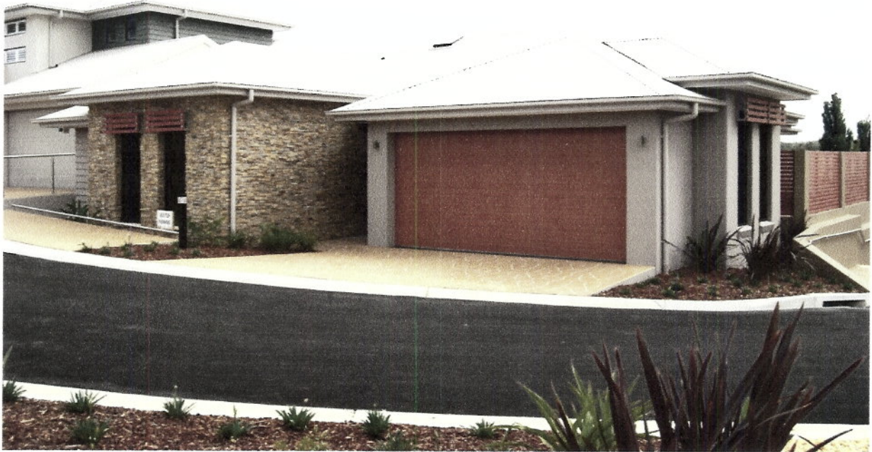
2011: Civil works completed in Stage 3 ready for slab. These people have been waiting for a home similar to above for 4 years.