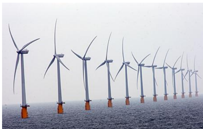
Thanet Wind Farm off the coast of Kent.

"Every time we were building onshore, the public reacts in a negative way and we had a lot of criticism from neighbours," said a spokesman for the government owned wind company. "Now we are putting all our efforts into offshore wind farms."