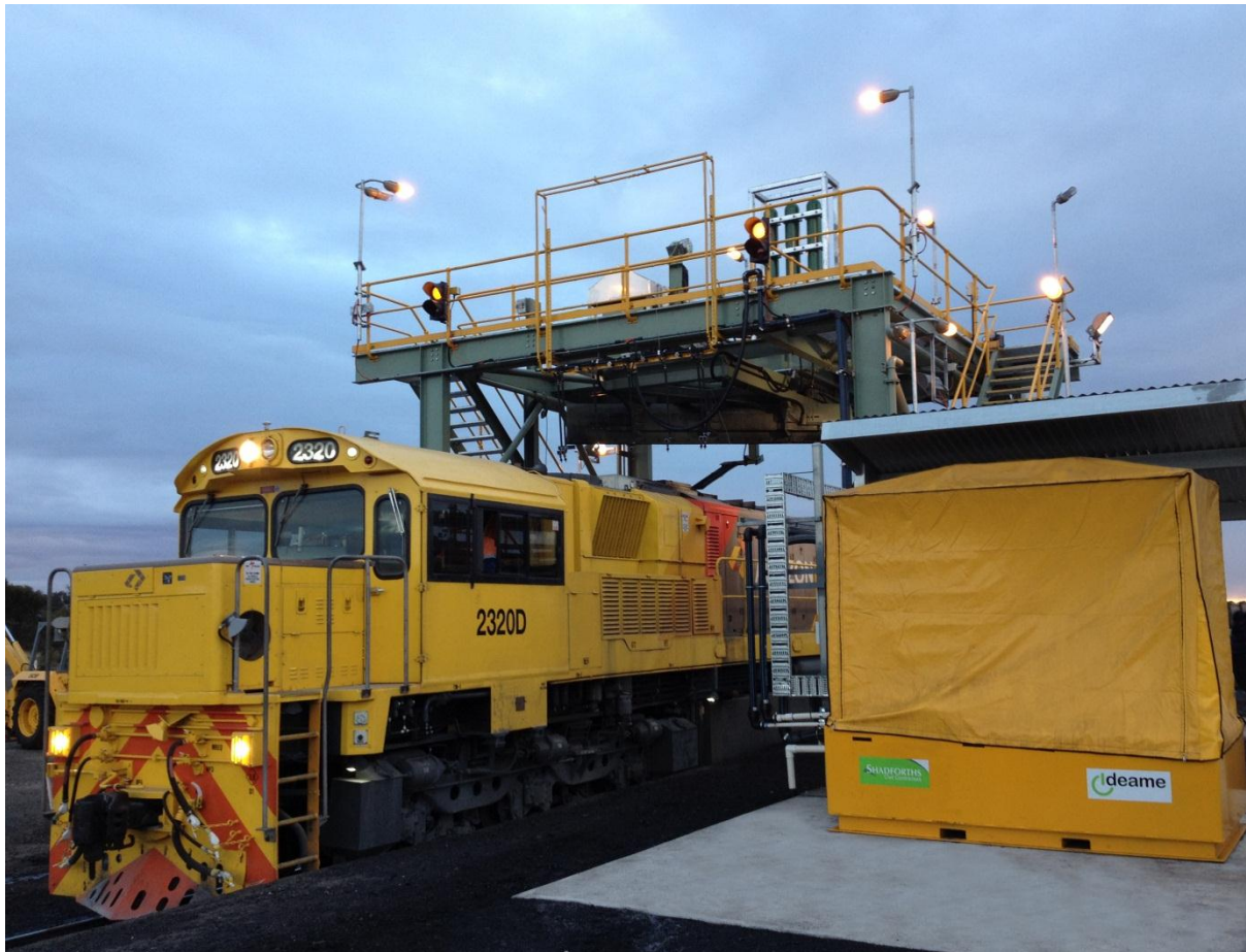
Wider photograph showing the profiling and veneering facility structure.