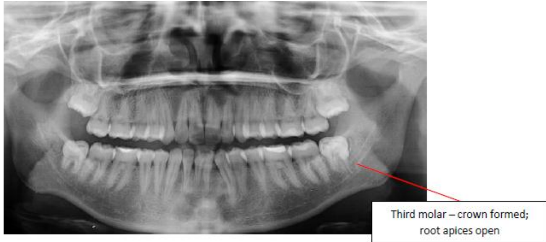
Fig 2 OrthoPantomoGraph (OPG) - Aged 18 years - Crown Formed; Root Apices Open