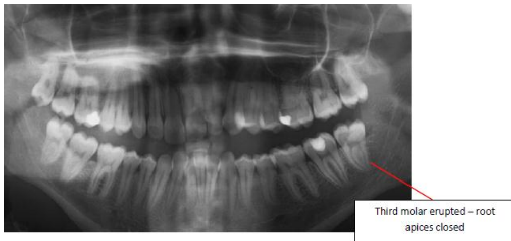
Fig 3 OrthoPantomoGraph (OPG) - Aged 20 years - Third Molar Erupted; Apices Closed

The assessment of the development of the third molar provides an ideal means to discriminate between an adult and a child. Most recent studies have shown that complete closure of the apices of the third molar teeth is an indication that the living individual is over the age of 18 years and thus, by definition, an adult [23].