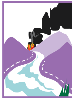
▲ Water supplies can be protected by leaving at least a 50 foot buffer zone from the high water line.