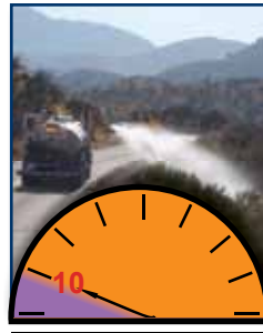
▲ Vehicle speeds should be less than 10 miles per hour.

Domestic Water Supplies. - When retardants are used near water supplies, the same precautions should be exercised as described for fish and aquatic organisms. Leave at least a 50-foot buffer zone from the high water line. Plants and soil normally absorb a majority of chemicals before they wash or leach to the body of water.