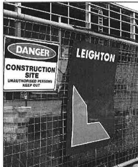
Risks: Leighton Holdings.

At the same time as Australian companies increase their footprint in developing countries, the risks become greater, making it a greater issue for boards.