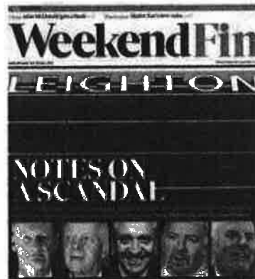
Weekend Fin p43